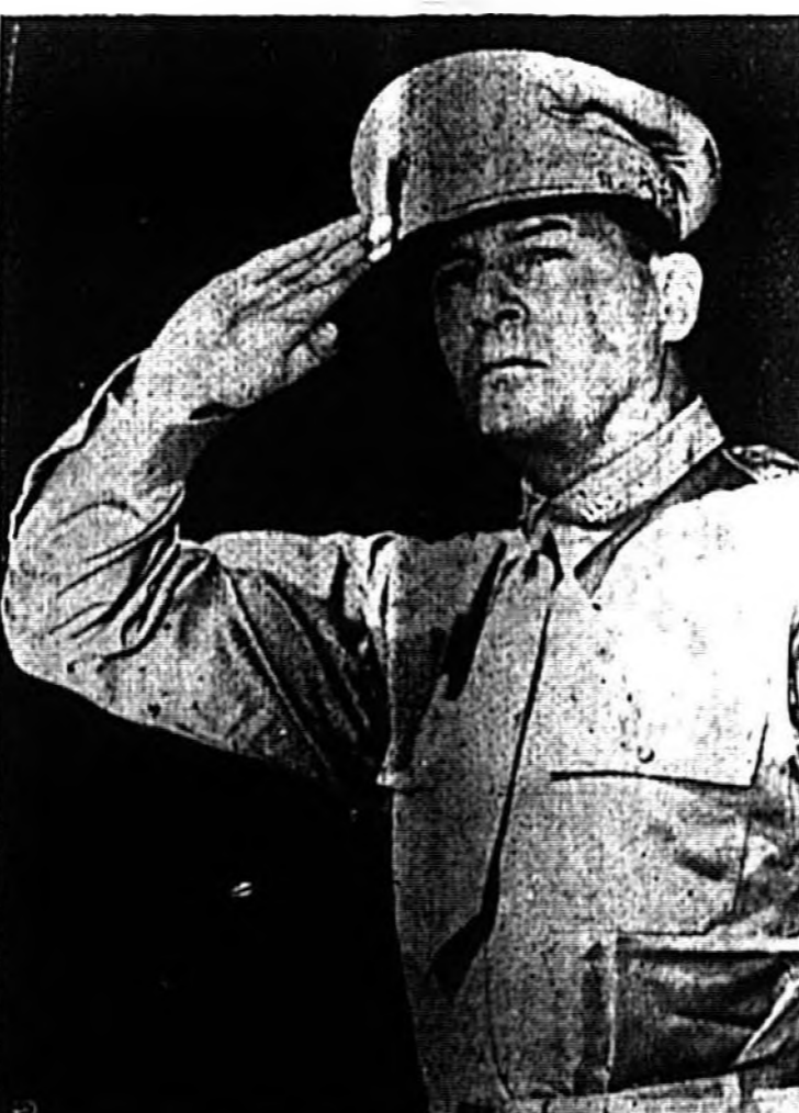
General Douglas MacArthur has been designated by President Truman as Supreme Allied Commander to accept the surrender of all Japanese Army and Naval forces and will govern Japan following the formal surrender.