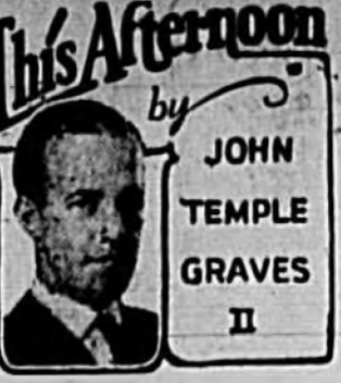
This Afternoon by JOHN TEMPLE GRAVES II

It is not surprising that the new law has been met with such approval. The legislature, in its wisdom, has provided for a return for four years of opportunity.