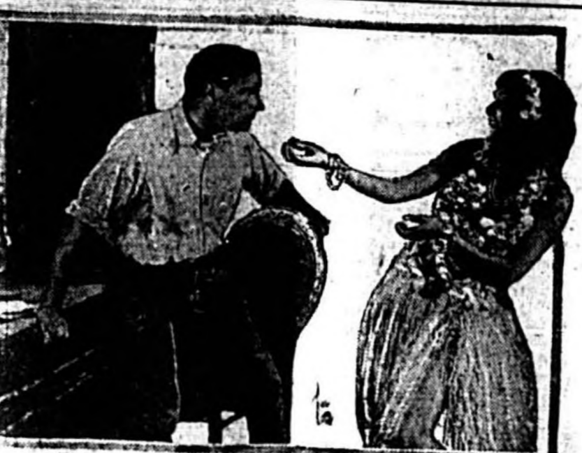
Conway Tearle and Dorothy Sebastian in a Scene From 'Isle of Forgotten Women'