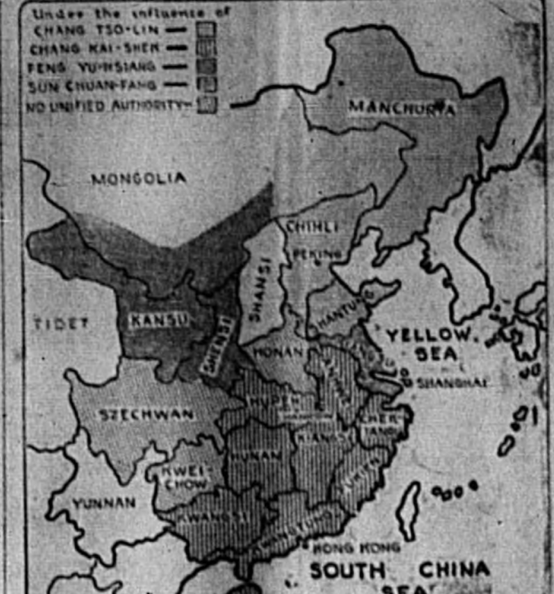
Under the influence of CHANG TSO-LIN, CHANG KAI-SHER, FENG YU-SIANG, SUN CHUAN-FANG, NO UNIFIED AUTHORITY.

Here's a sketch of what's wrong with China. Each province shown on the above map has its own governor or local ruler; superimposed on the collection of governors is an assortment of "war lords," exercising military authority as the key to the map indicates. The result is chaos.