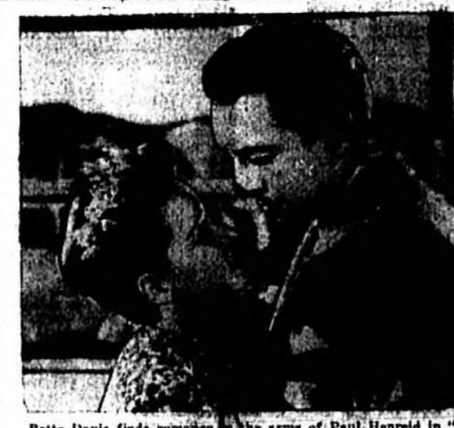
Bette Davis finds romance in the arms of Paul Henreid in 'Now, Voyager,' a dramatic thunderbolt unleashed upon the screen of the Ritz Theater next Sunday and Monday.

GUADALCANAL, Mar. 12. (Special)—The famous incident of the football star who scored a touchdown, only to discover that he had run in the wrong direction, was recalled here when a Marine unintentionally got deep into Japanese lines during the January fighting.