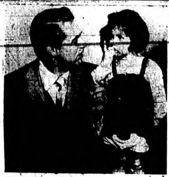
PIA STAR CARY GRANT turns on the charm that captured the hearts of countless female film fans and gets nowhere with the disinterested young lady beside him. It all took place in New York City when Cary participated in a drive by the CIO to obtain funds for local welfare agencies. They met at Hamilton House Settlement.