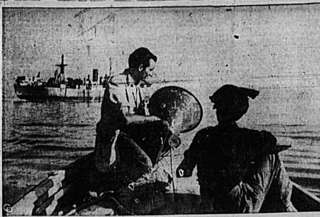
USING A LOUD SPEAKER, agents of Haganah, Jewish resistance organization, try to get messages of cheer to refugees aboard the S. S. Ocean Vigor, as it lies off Port de Bouc, France...