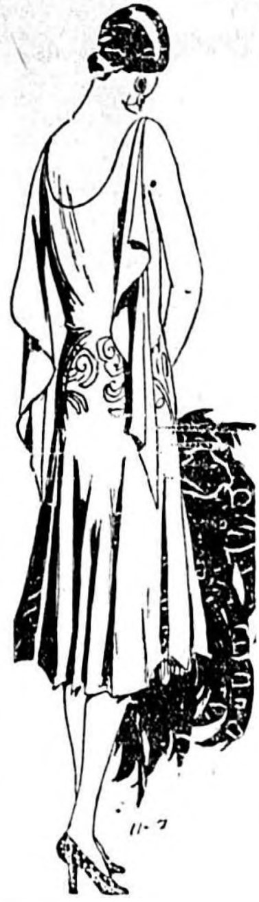
This tango frock from Redfern of Paris is made of soft silk crepe with beading around the hips.

shows a tango frock from Redfern of Paris, simply made of crepe with beading used about the hips. The shoulder drapery, while not essential, appears quite frequently, and adds grace to the tango dancer.