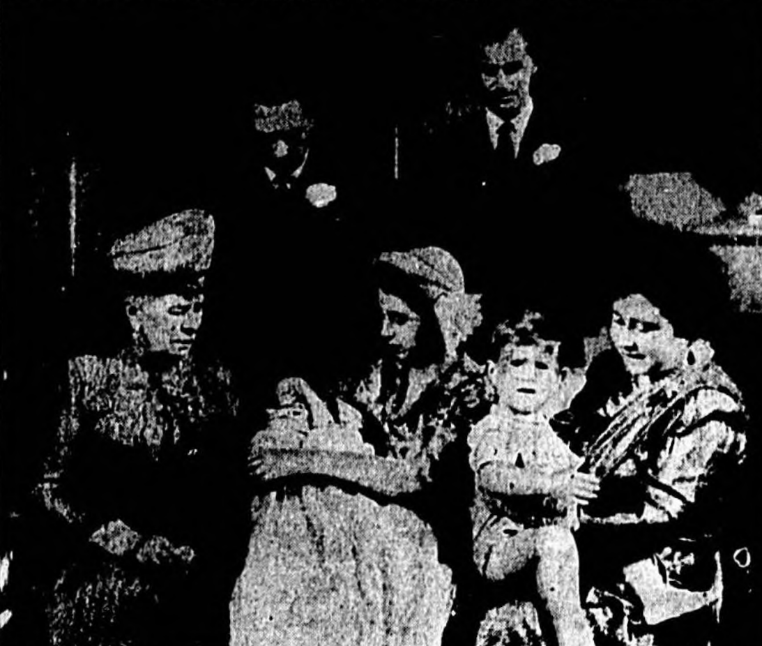
KING GEORGE VI IS SHOWN IN Buckingham Palace, London, with members of the Royal family shortly before his death. In the group (l. to r.) are: the Dowager Queen Mary; Queen Elizabeth, holding daughter, Princess Anne and Queen Elizabeth, now Queen Mother, holding Prince Charles. The late King and Prince Philip, consort of the new Queen, stand in the background.

ROBSON SPORTING GOODS 200 East First Street Phone 098