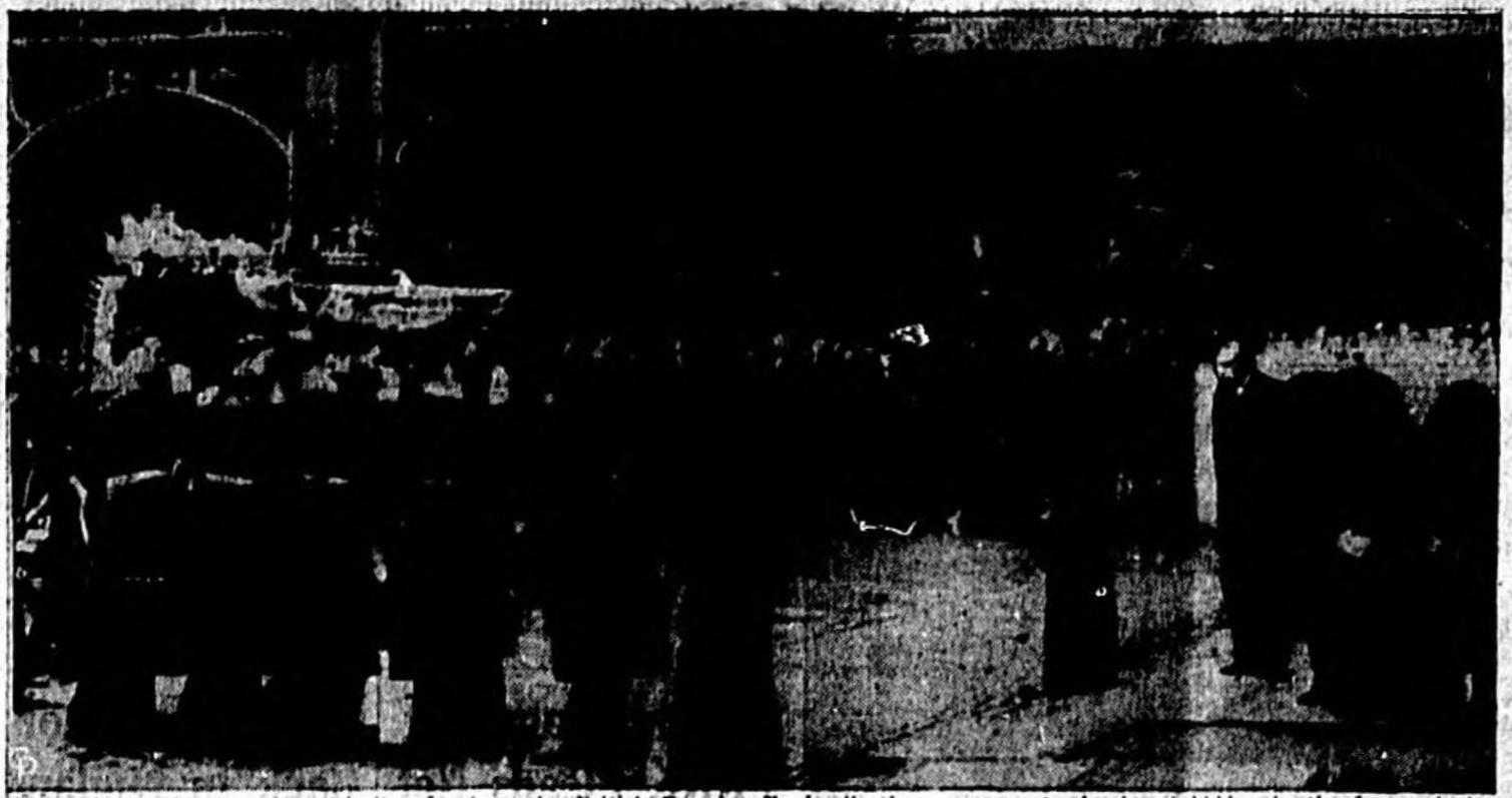
Moving slowly through a drizzling London rain, British Guardsmen pallbearers carry the flag-draped coffin of King George VI into Westminster Hall, where the monarch's body will lie in state until the final rites. The imperial crown rests on top of the casket. At right, England's three queens stand, almost hidden in the foggy shadows, of the entrance. They are (l. to r.) Queen Elizabeth II, Queen Mother Elizabeth and Dowager Queen Mother Mary.