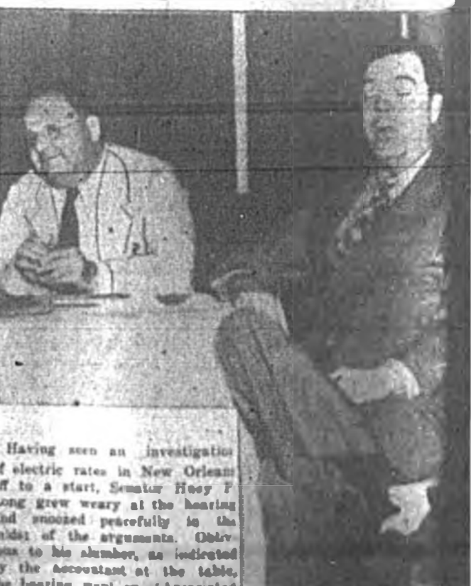
Having seen an investigation of electric rates in New Orleans off to a start, Senator Huey P. Long grew weary at the hearing and snored peacefully in the midst of the arguments. Oblivious to his slumber, as indicated by the accountant at the table, the hearing went on.