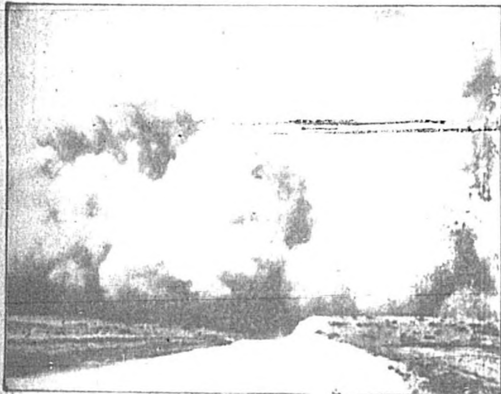
This striking picture made from Hotchkiss, Okla., shows the blackest and worst of the many dust storms that have been raging over the West. The wind is so strong that it is impossible to see more than a few feet ahead.