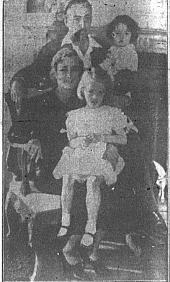
This happy-looking family circle of John Barrymore, the actor, his beautiful wife, the former Dolores Costello, and their children is together no longer. Reports have it that Dolores has moved out of their Paris home in Beverly Hills and Hollywood is wondering what their future will be.