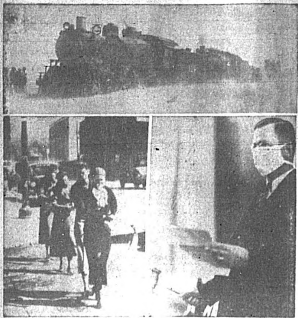
With ill winds continuing to blow from Midwest farms and spread it in choking clouds, railroads tolled to keep trains from being stalled in the dust. (Left) A train stalled in the dust near Dodge City, Kan. At the bottom, a woman wears a mask. (Right) A man wears a mask and clinging to a railing on a train. (Bottom right) A man wears a mask.