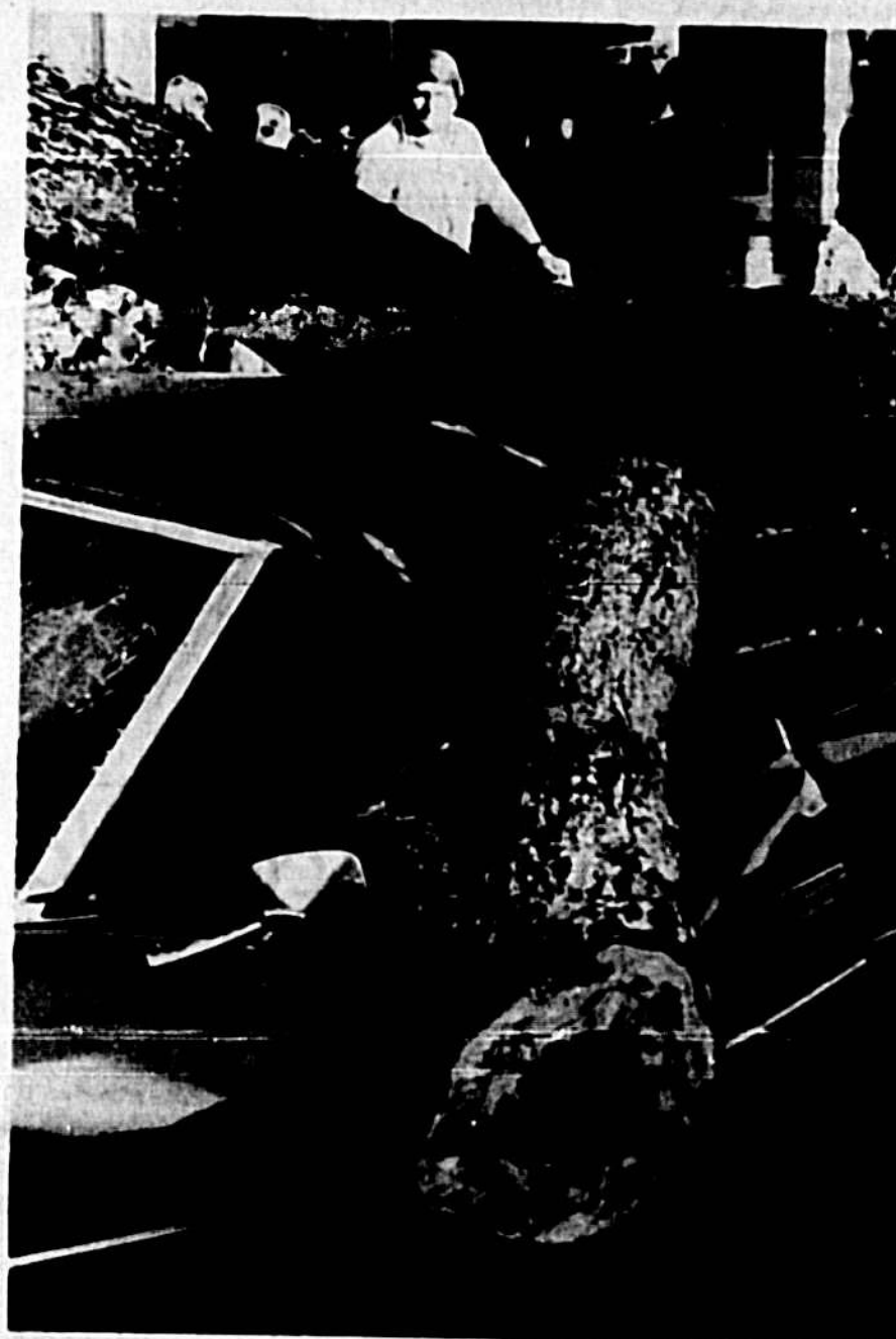
'I HEARD A CRASH'