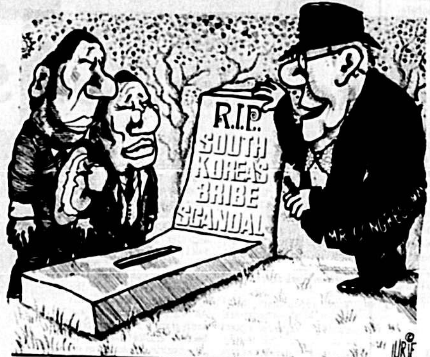
"I assume you came to pay your last respects?"

We have picked up a few names, but we have gathered enough evidence to mention only one. He is the powerful and popular Rep. John B. Anderson, D-Calif., a lone congressman with length-hair, a hippy-style mustache, and a liberal voting record. He is a chain smoker who habitually dumps his cigarettes in an empty ash can during congressional proceedings.