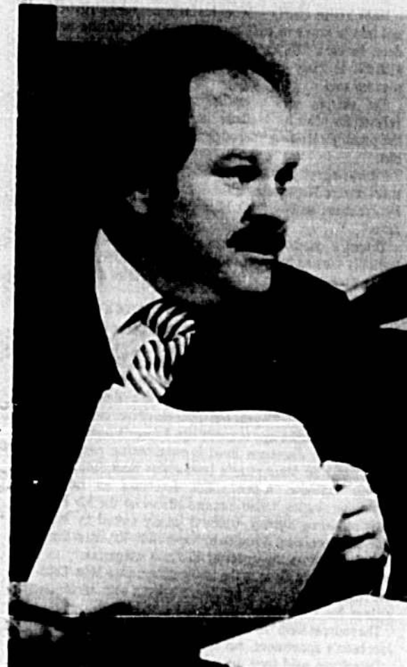
STATE ATTORNEY CHESHIRE