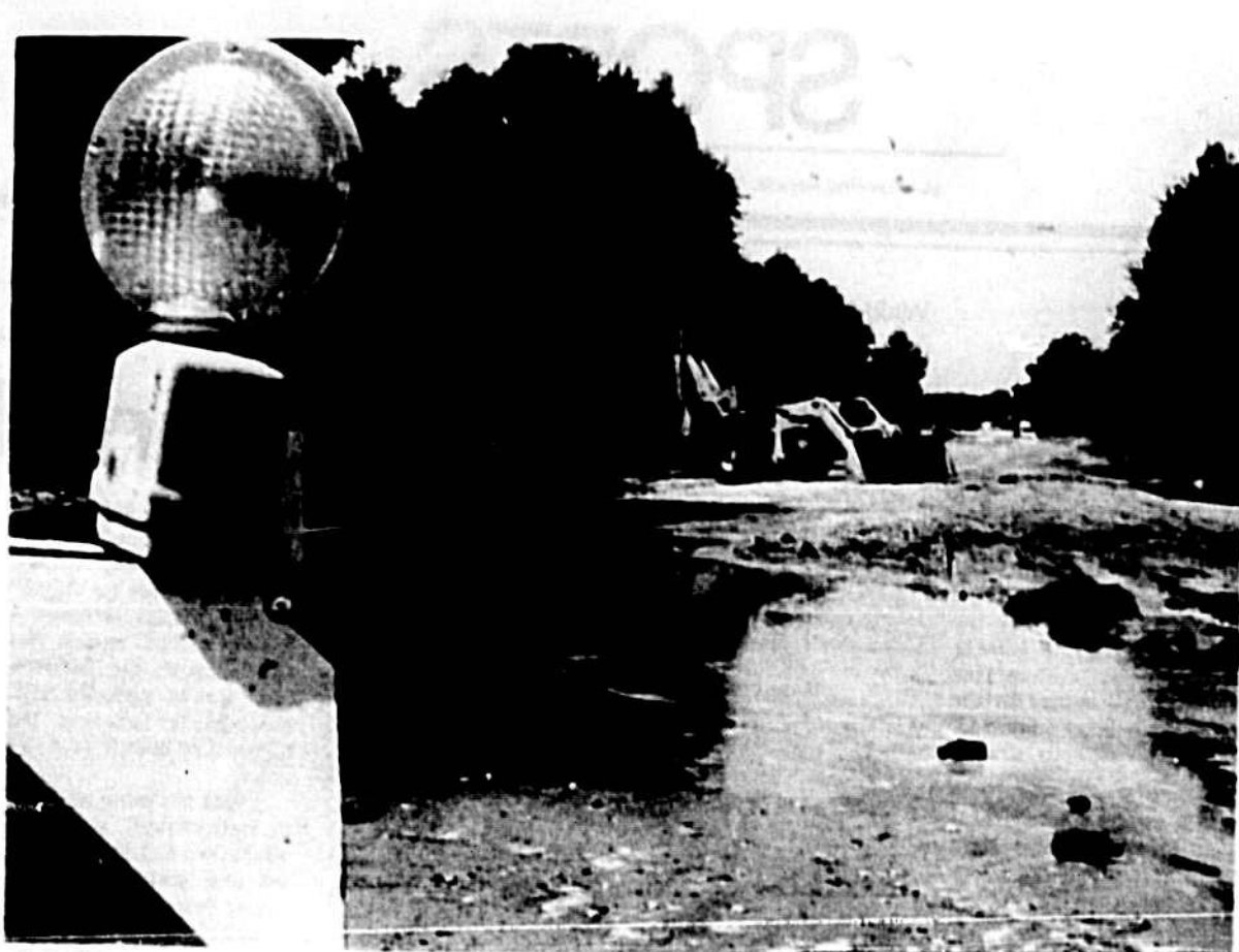
THE WAY IT WAS AT N. EDMONSON AVE. BEFORE ROAD WAS WORKED ON

Rozansky said the lake is now one inch higher than the road and the spillway is clogged. Piland said the retention pond receives large amounts of water off the public streets in that area.