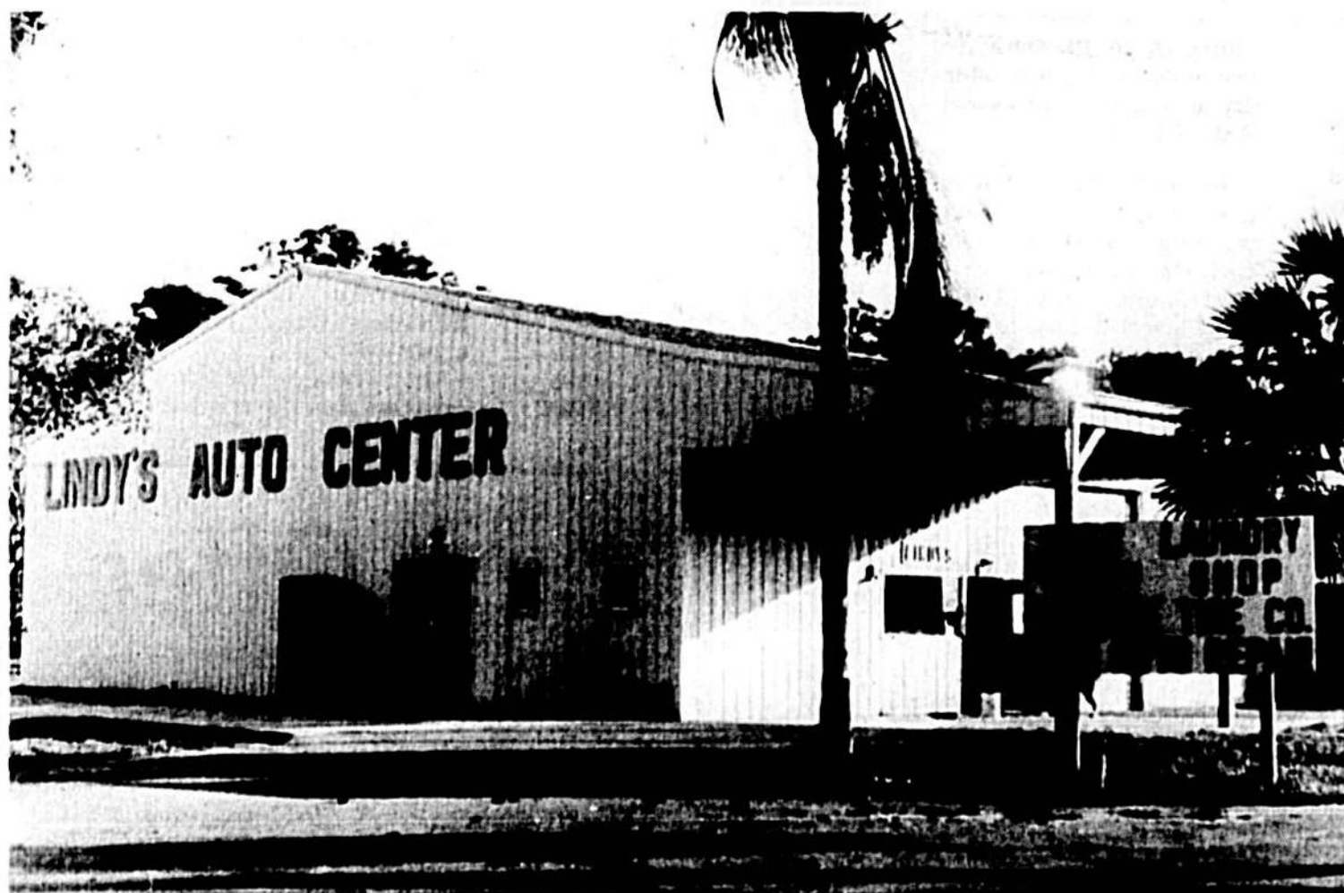
LINDY'S AUTO CENTER PROVIDES ONE STOP SERVICE