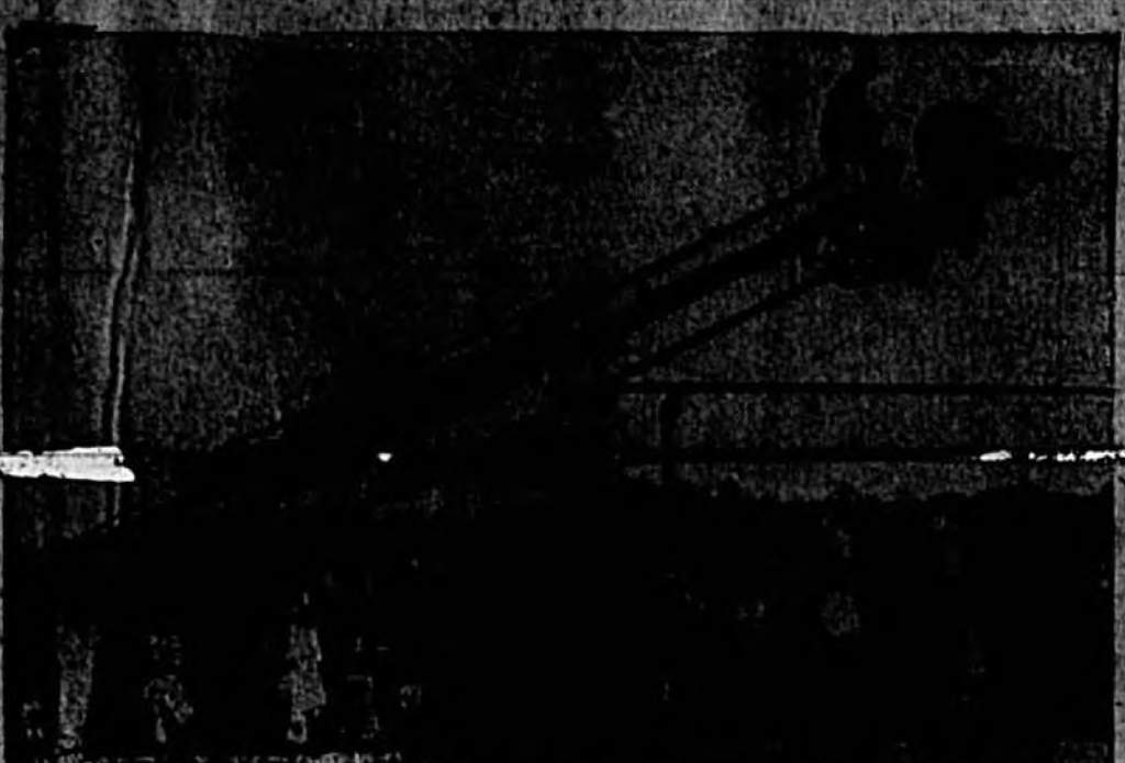
HOLLYWOOD, Cal.—Portable aluminum camera frame, invented by technicians here, is the new motion picture "gadget" to aid cameramen in securing the unusual effects which characterize modern sound production. Although the outfit looks ponderous and heavy, it is very light.