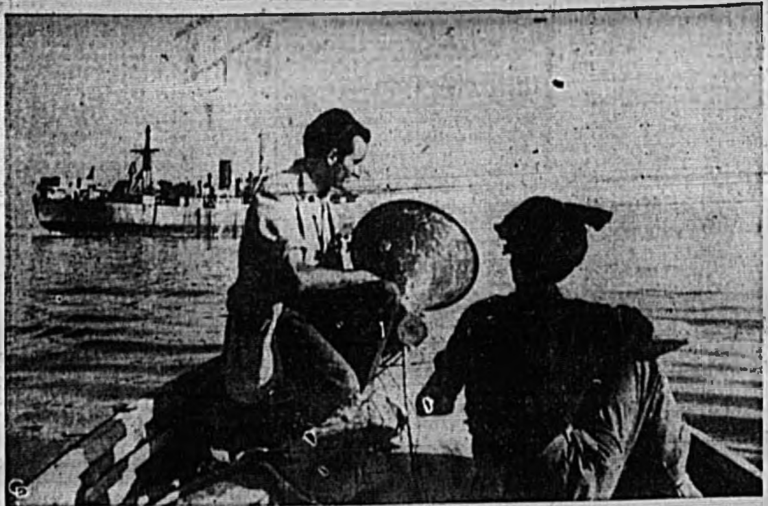
USING A LOUD SPEAKER, agents of Haganah, Jewish resistance organization, try to get messages of cheer to refugees aboard the S. S. Ocean Vigor, as it lies off Port de Beau, France.