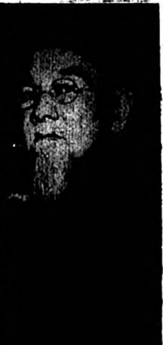
ABOVE is the latest picture received in this country of Lin Sen, president of the Chinese. President Lin lives on the outskirts of much-bombed Chungking.