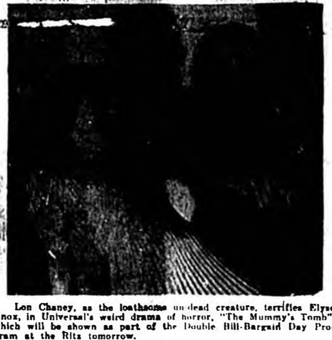
Lon Chaney, as the loathsome undead creature, terrifies Elyse Knox in Universal's weird drama of horror, 'The Mummy's Tomb', which will be shown as part of the double Bill-Burgard Day Program at the Ritz tomorrow.

All mammals, from a tiny mouse to the giraffe, have seven vertebrae in the neck.