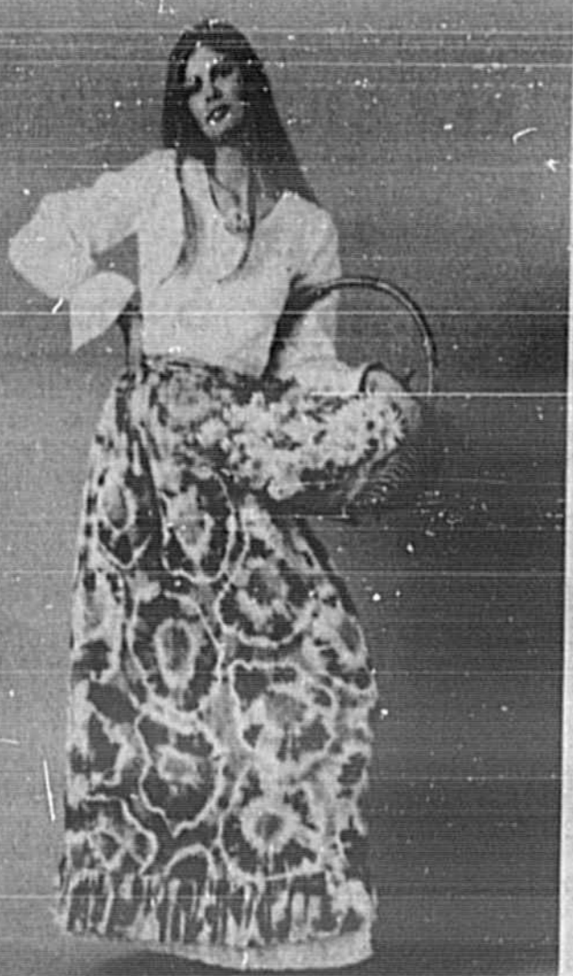
Skirt shows beauty of fluidity of tie-dyeing