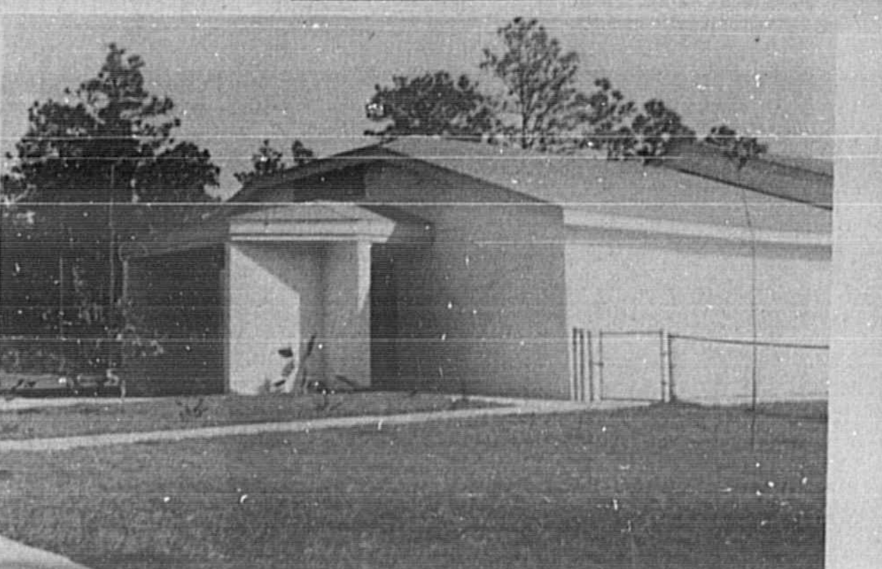
Harbor School opened in September.