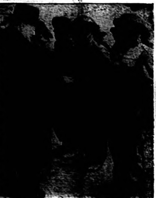
Prime Minister Winston Churchill seems amused as he examines the knife of a Commando during his inspection of the famed British fighters...