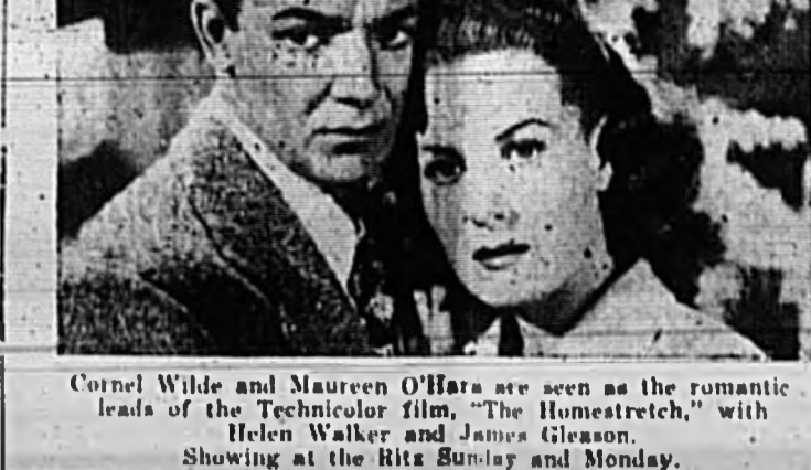
Cornel Wilde and Maureen O'Hara are seen as the romantic leads of the Technicolor film, "The Homestretch," with Helen Walker and James Gleason. Showing at the Ritz Sunday and Monday.