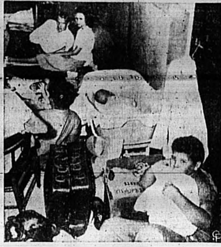
MEN, WOMEN, CHILDREN SEEK SHELTER AS HURRICANE NEARS