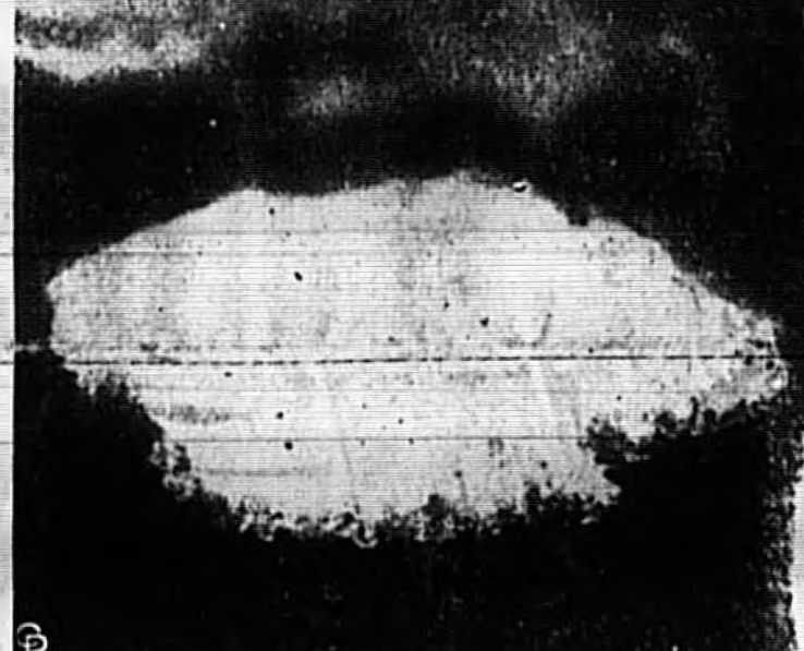
AMONG THE THOUSANDS who sought safety as a tropical hurricane began to move toward the Florida coast were these residents of West Palm Beach. They are shown (top) seeking refuge in the County Court House. At bottom is a unique photo made by a trained weather reconnaissance crew which flew in a Navy plane into the heart of the hurricane. Using radar instruments, it came as it gathered force off the Bahamas. Using radar instruments, it located the exact center of the storm and photographed a huge area of water as it was raised from the surface of the ocean.