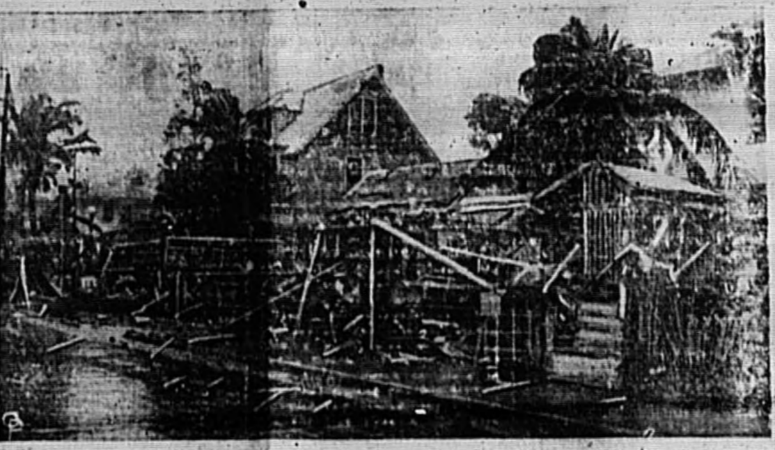
THIS IS A TYPICAL STREET SCENE in Miami, Fla., with the skeletons of hundreds of small business places standing in long rows after the tropical hurricane had swept through the city causing millions in property damage. After passing over southern Florida, the storm swept into the Gulf of Mexico, only to turn northward and aim at the south Louisiana coast and the new New Orleans area.