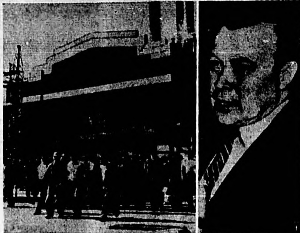
120,000 QUIT JOBS IN FORD PLANTS — Ford Motor Company workers leave the giant Ford Rouge plant (left) in Detroit, after the United Auto Workers called the first nation-wide strike against the motor company. Strike was ordered by UAW President Walter Reuther (right) after Ford and the union failed to agree on a contract despite almost continuous bargaining sessions.