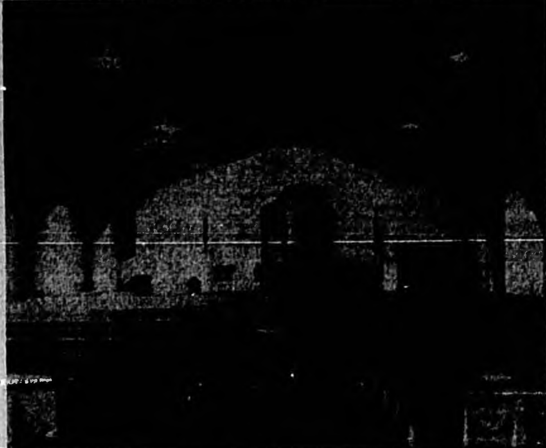
DEDICATION SERVICES Sunday of the enlarged and beautifully designed sanctuary of the Lutheran Church of the Redeemer will mark completion of the second step towards the overall plans for the church plant at 103 W. 5th Pl.