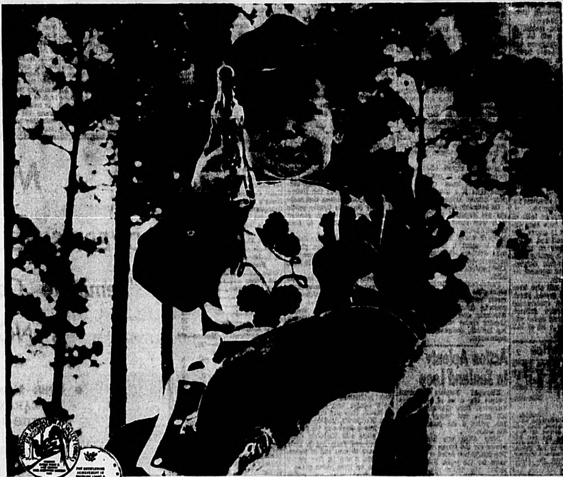
This advertisement is one of a series that won national recognition for Florida. The Frazer Foundation awarded it the George Washington Honor Medal for dramatizing freedom's vital importance in every field of American endeavor. A similar program in 1953 also captured this coveted award.