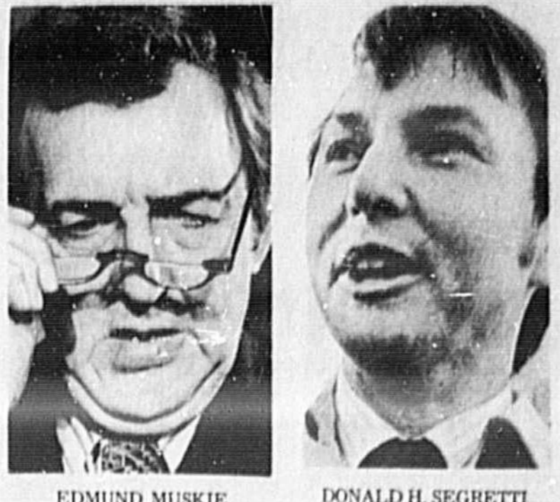
EDMUND MUSKIE DONALD H. SEGRETTI