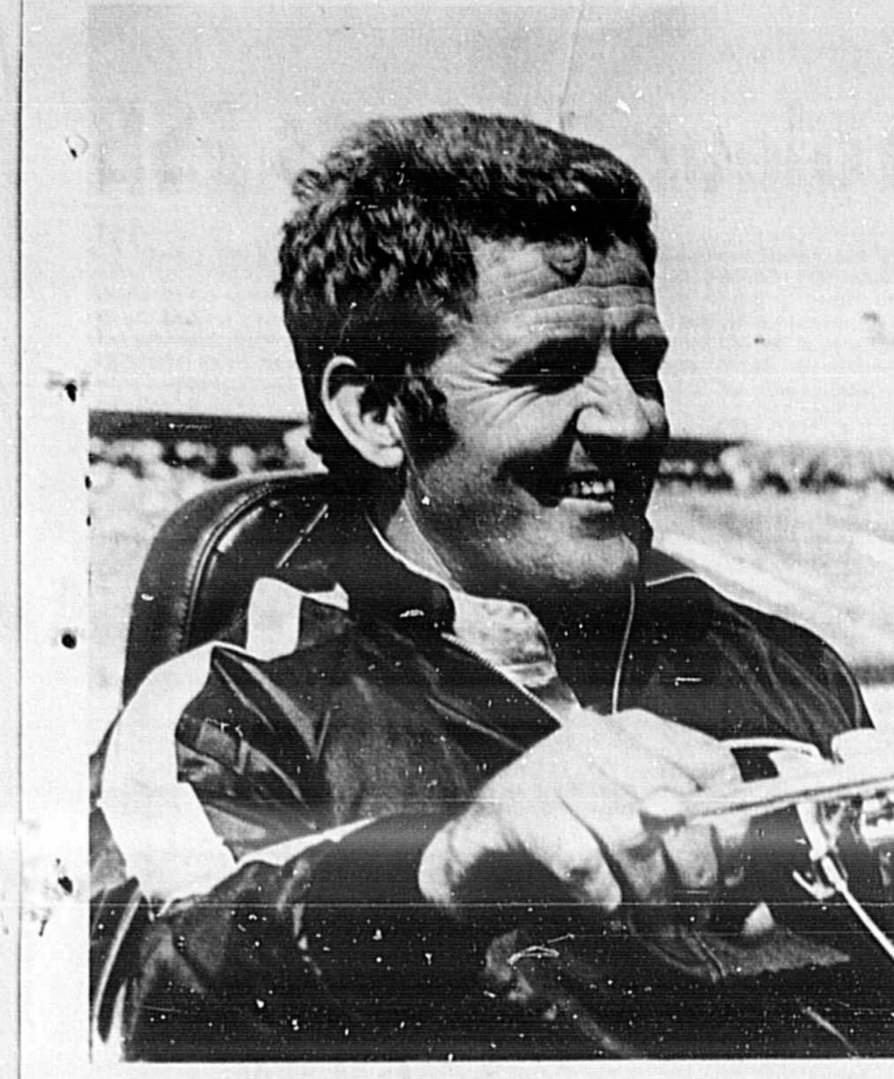
JAMES HYLTON LEADING WINSTON CUP POINTS RACE ... Several drivers will be shooting to take the lead away

How to save over $2000. If you're thinking about buying a second car to commute — don't. Think about buying a Yamaha. You'll be miles ahead with this economical means of transportation.