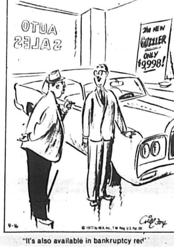
"It's also available in bankruptcy red"