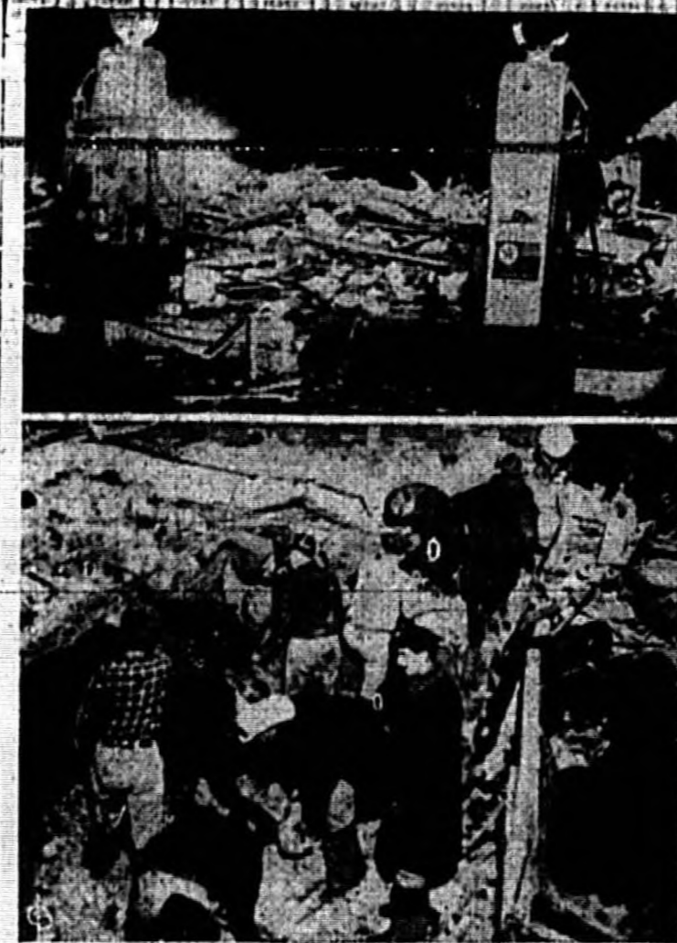
A GENERAL VIEW of a wrecked gasoline station in Washington, D. C., is shown (top) after an explosion of the station claimed the life of Leo Mattingly, 30, its co-owner. Three persons were injured, one of them—Francis Mattingly—critically. The blast was heard for two miles and shattered windows for eight blocks. In the bottom photo firmen search the debris surrounding the ruined station.