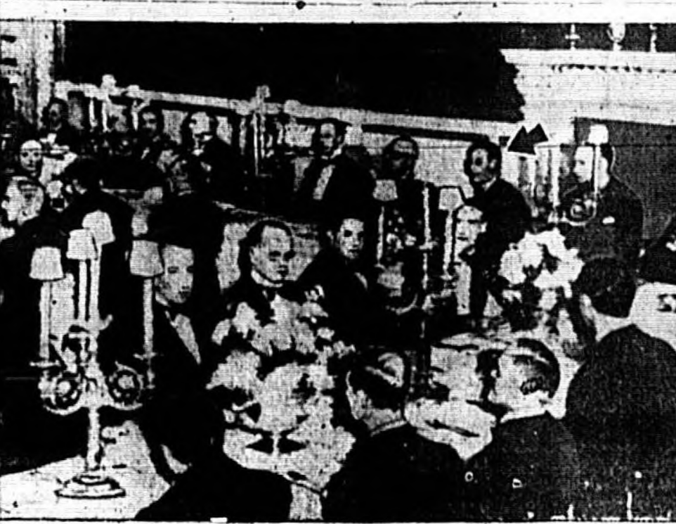
AT A FORMAL BANQUET IN ST. JAMES'S PALACE on the evening prior to the first session of the United Nations Organization Assembly in London, the 2,000 delegates of 51 nations were guests of King George VI. Pictured in the back row (right) against the wall are (L to R): Lord Jowitt, Eduardo Zuleta Angel of Colombia, president of the Preparatory Commission of the UNO; King George VI; Paul Henri Spaak, Foreign Minister for Belgium; and Prime Minister Clement K. Atlee of Great Britain. This was the first time that pictures were allowed to be taken of a state banquet in Great Britain.