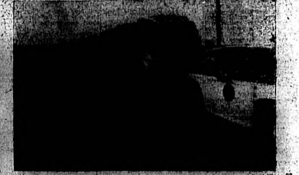
With mechanical equipment in the form of 18 Florida Motor Lines buses, operated by 600 editors, members of the National Editorial Association, toured Florida for seven days, traveling over 1,500 miles and visiting 23 towns and points of interest. The group is shown here entering McDill Field, Southwestern Army Airbase at Tampa.