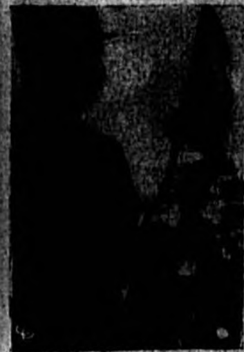
Filming a Convoy at Sea