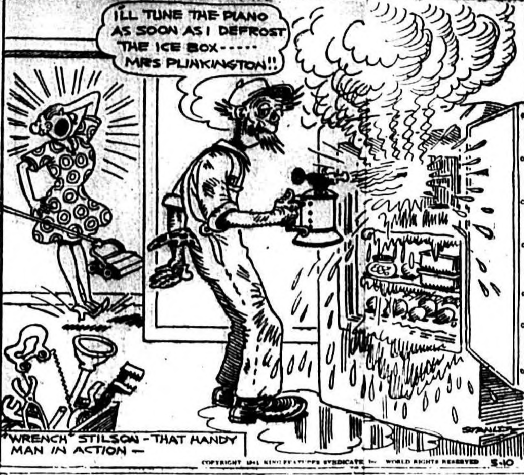
WRENCH STILSON—THAT HANDY MAN IN ACTION