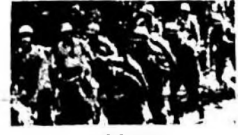
U. S. Troops