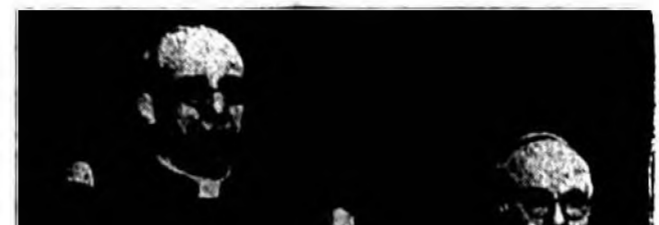
FIGURED THE LAST TIME THE VATICAN AND ARCHBISHOP SPELLMAN MET IN BOSTON DURING HIS VISIT TO THE U.S. IN 1937. IT IS REPORTED THAT BISHOP SPELLMAN IS NOW AT THE VATICAN WITH THE POPE.