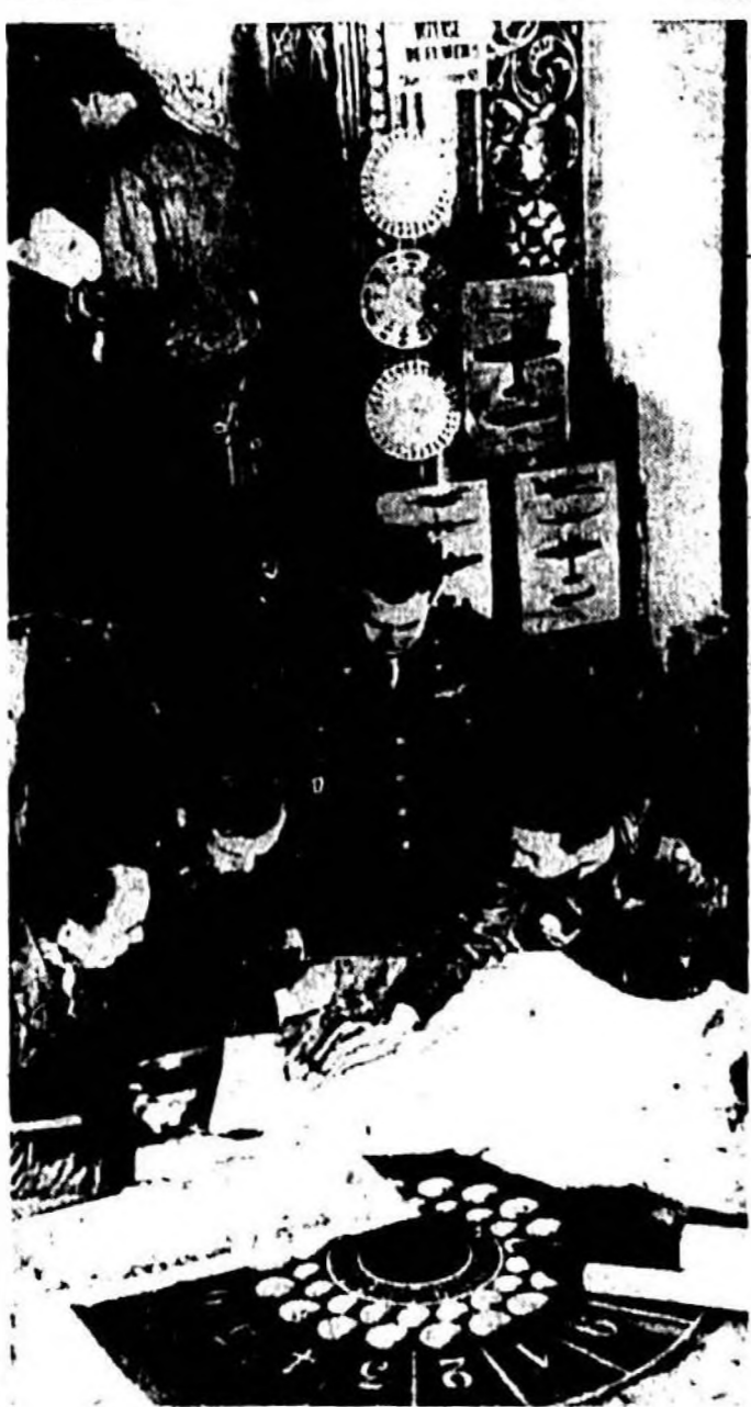
AMERICAN AIR FORCE OFFICERS, planning a raid on an Axis base, chart their objectives in an old gambling casino in Tunisia, where slot-machine playboys once tossed their money about with abandon. Their maps and aerial reports are spread on a roulette wheel.