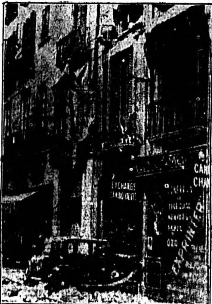
This radio picture of a street in Madrid was taken shortly after a bitter battle in the Spanish capital. Note the automobile driven into the store front. Estimates of the number of dead in the socialist and communist uprising ranged from 500 to 1,000.