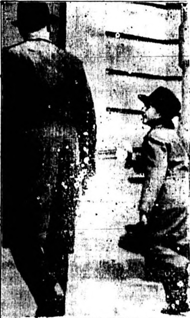
This picture of the new boy king of Yugoslavia, Peter, 11, was radioed to America from London where the 11-year-old son of the slain king Alexander was taken to his country's legation prior to beginning his trip to Belgrade for the funeral. He is shown (right) ascending the legation steps with his father from the English school he was attending.