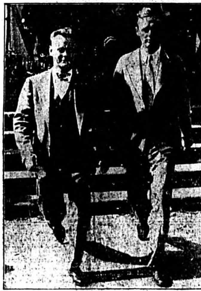
The voice that shouted "Hey, Doc!" over a Bronx cemetery wall the night Col. Charles A. Lindbergh paid $50,000 in a futile attempt to ransom his infant son, has been identified by the father as that of Bruno Richard Hauptmann, indicted for the murder of the child. Colonel Lindbergh gave his testimony before the Hunterdon county grand jury in Flemington, N. J., and he is shown as he left with a New Jersey official.