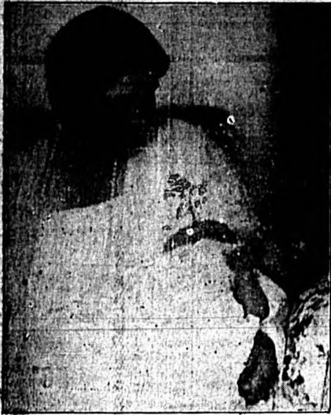
Beautiful Queen Marie of Yugoslavia was left a widow at the age of 35 by assassins' bullets that felled her husband, King Alexander, at Marseilles. Torn with grief, she boarded a train in Belgrade to hurry to the French city upon hearing the fateful news. The queen is shown with her youngest child, Baby Prince Andrew, in arms.