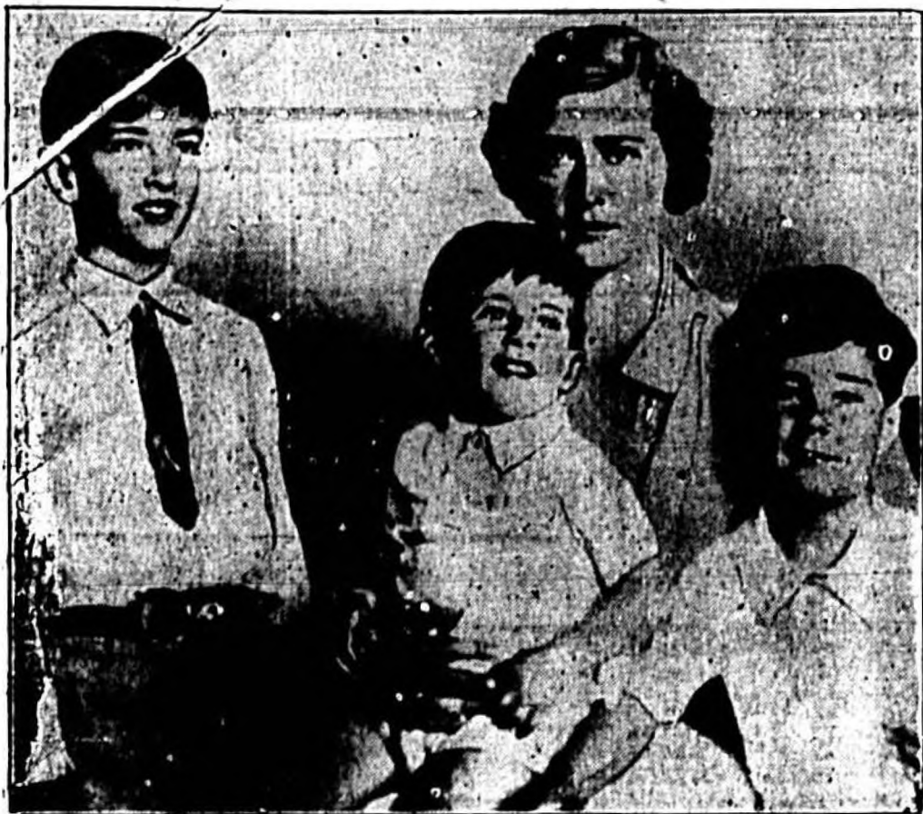
Queen Marie, widow of King Alexander of Yugoslavia, is pictured with her three children, Crown Prince Peter (left), who will be proclaimed king, Prince Andreja (center) and Prince Tomislav.