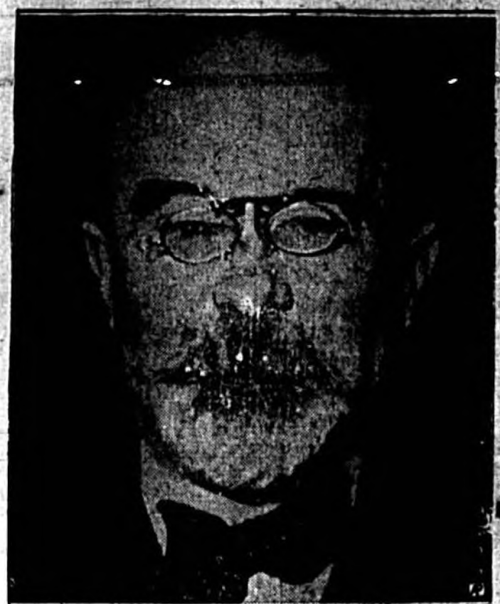
Riding in an automobile with King Alexander of Yugoslavia, Louis Barthou (above), foreign minister of France, was slain by bullets fired by assassins at the monarch at Marseilles, France. Barthou was believed only slightly wounded at first, but died while an operation was being performed.