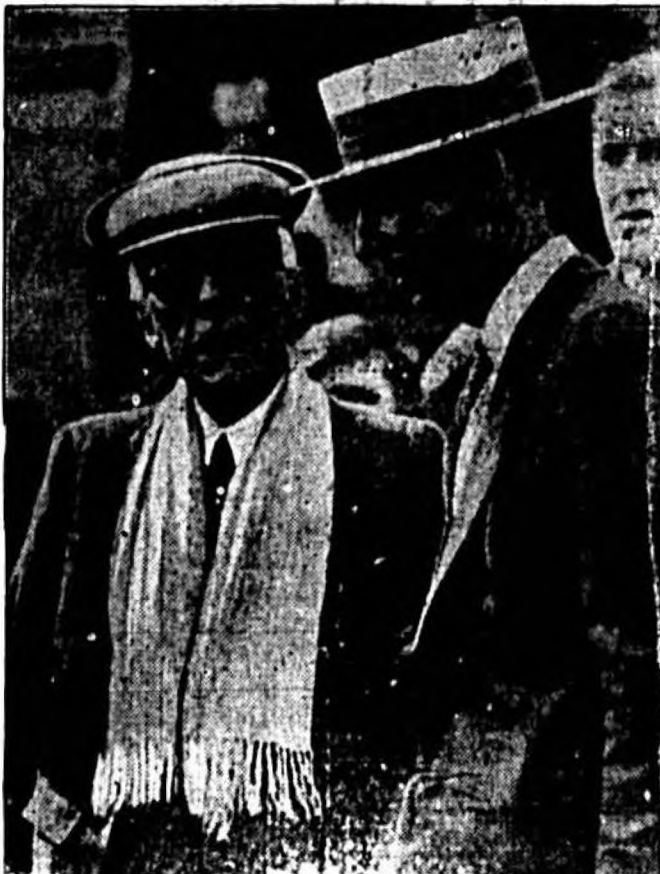
In good spirits and feeling fine, John D. Rockefeller, Sr. arrived in Florida for his annual winter sojourn, seeking sunshine and peaceful quiet. He is shown upon his arrival at Ormond Beach. "Indeed, I am glad to be back," he said as he stood on the station platform and posed for cameramen.