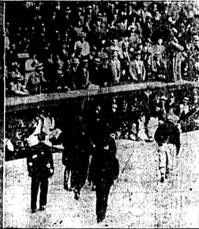
MEDWICK 'GETS THE GATE'