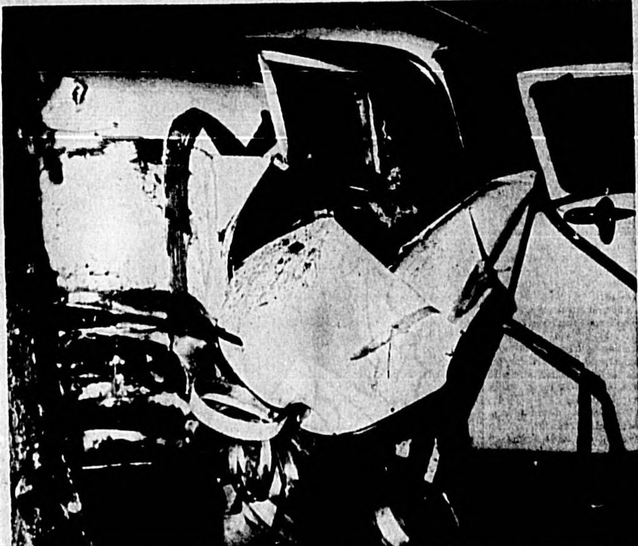
FIVE MEMBERS of one family were injured, one fatally, when this car crashed into a tree (at the left) about 2 this morning at Altamonte Springs.

A family spat Sunday evening resulted in tragedy for a young Fern Park family early today. A baby is dead and four other members are in Winter Park Memorial Hospital.