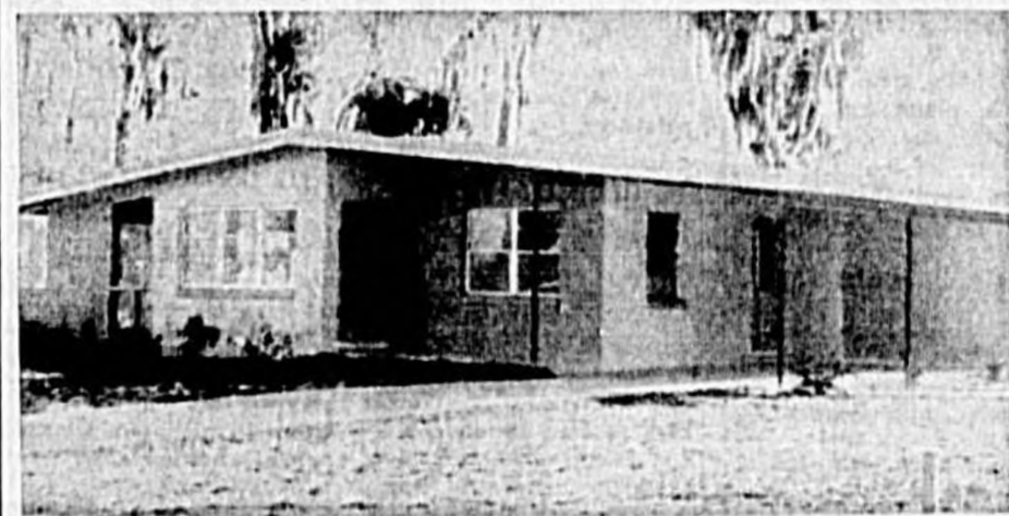
415 TANGELO DRIVE

"A COMMUNITY OF HOMES — BUILT WITH PRIDE"