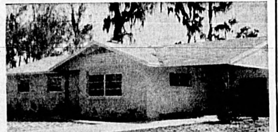
411 TANGELO DRIVE

FHA, FHA-In-Service, VA, and conventional financing.