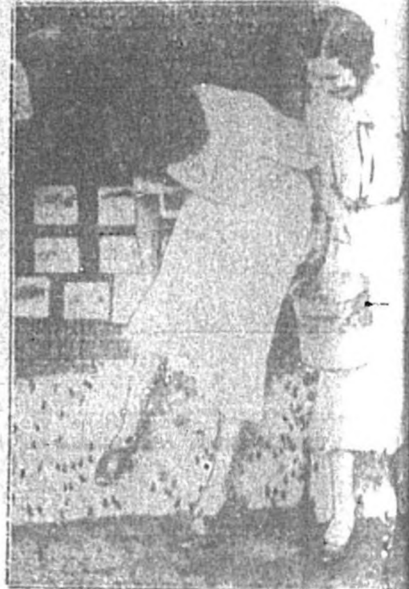
Oklahoma City citizens fought frantically with water and open palms when unrelenting swarms of crickets, virtually taking control of the city, attacked themselves to buildings and people. Girls are shown above as they fought off the insects in the street.