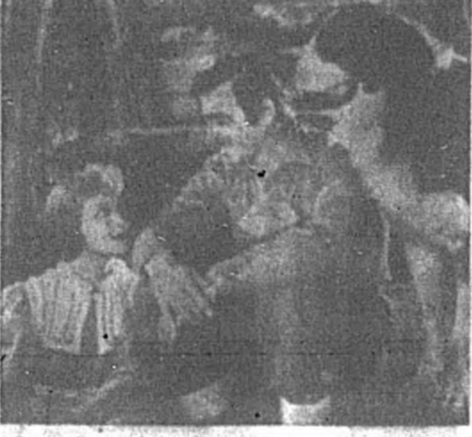
Loretta Young, Clark Gable and "Buck" present a pretty picture in "Call of the Wild," and is the feature attraction at the Milane Theater Sunday and Monday.