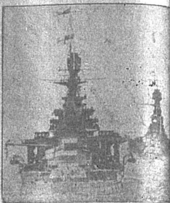
H. M. S. Renown (left) and Hood, two of the British fleet, which are reported to have been ordered to reinforce the British fleet at its base in Malta, were shown during naval exercises in the English Channel.