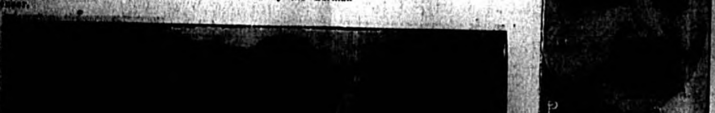
Red Henderson, mechanic, is shown looking sadly over the remains of the 1934 Ford sedan of George Barringer, Texas. The car was destroyed in a fire which swept the south garage section of the speedway at Indianapolis a few hours before the start of the 200-mile classic. An engine salvaged from the wrecked car was used to start the race.