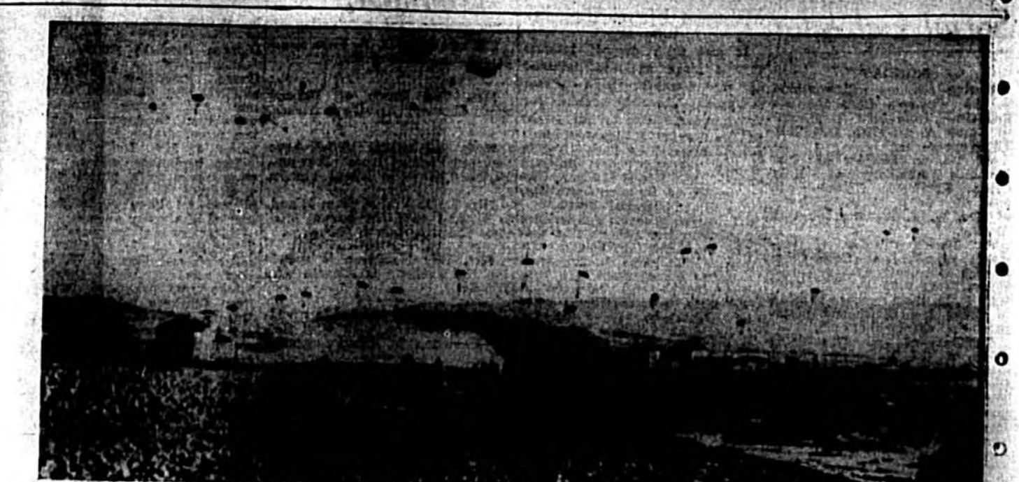
German paratroops fill the sky as they jump out of transport planes over Crete to attack British forces on the strategic Mediterranean island. Thousands of the paratroops were slain even before they landed, but came in even increasing numbers, aided by transport-landed troops, until they gained a strong foothold on the island and went on to sweep back the British. Light field pieces and tanks were also brought over by plane. This picture was released by the German censor and redied from Berlin to New York.