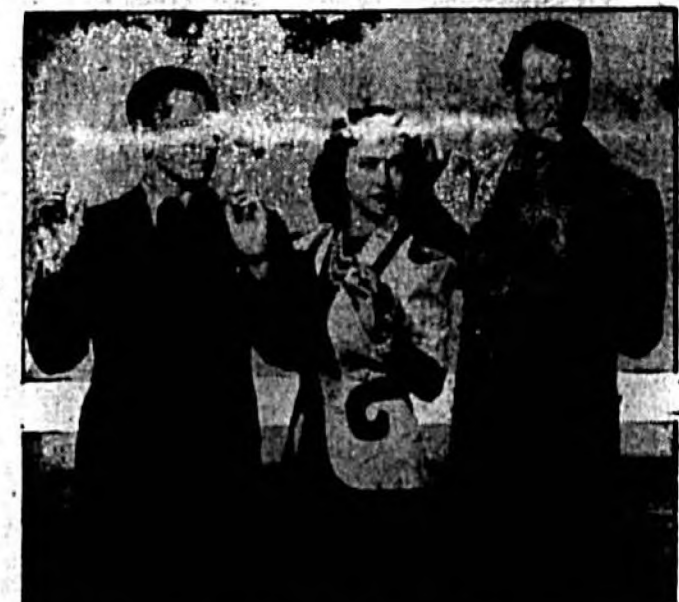
JOSEPH SCHILDKRAUT (left) with Margaret Lindsay and Ralph Bellamy are pictured above in a scene from "Meet The Wildcat," a really exciting mystery thriller in which comedy has a major part, to be shown next Friday and Saturday at the Ritz Theater.