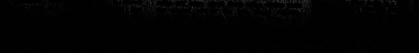
Death of ex-King Protobop, 47, of Rome (Italy), in London, is shown in this picture. He was killed in a crash landing of the plane he was flying over the English Channel.

Sanford Superior in Hits, Kicks To Make Bingles When They Are Needed. Kettles Drives In Local Lone Rally. "Goose" Turns In Splendid Performance At Mound.