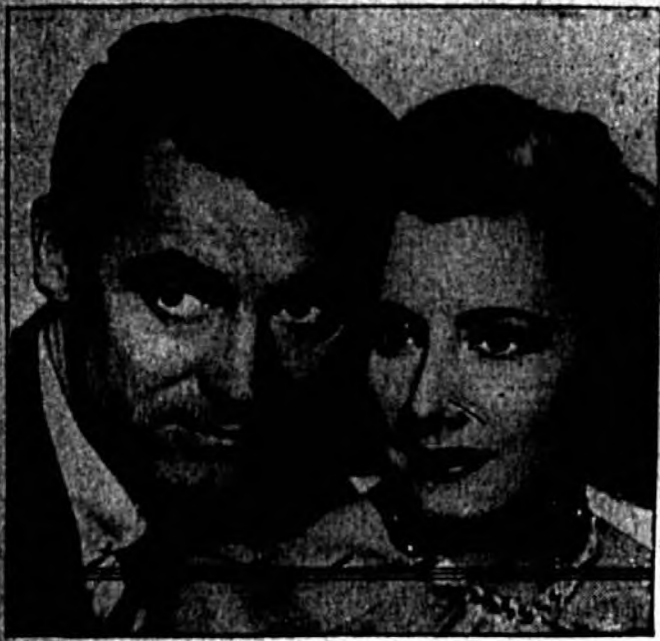
IRENE DUNNE and Cary Grant, one of the most popular romances in Hollywood, are reunited tomorrow and Monday at the Ritz in "Penny Serenade," sensational new George Stevens production.