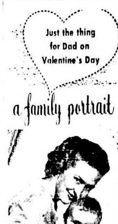
Just the thing for Dad on Valentine's Day. a family portrait.