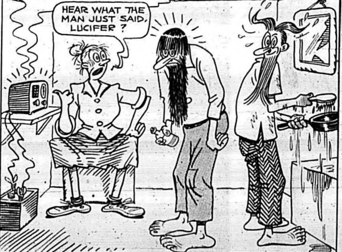
BACK ROAD FOLKS—THE RADIO GLAMOUR HOUR—STANLEY

IN A RECENT NATION-WIDE SURVEY 97 1/2 PER CENT OF THE WOMEN INTERVIEWED SAID "THEY DIDN'T GO FOR PLASTERED-DOWN HAIR."