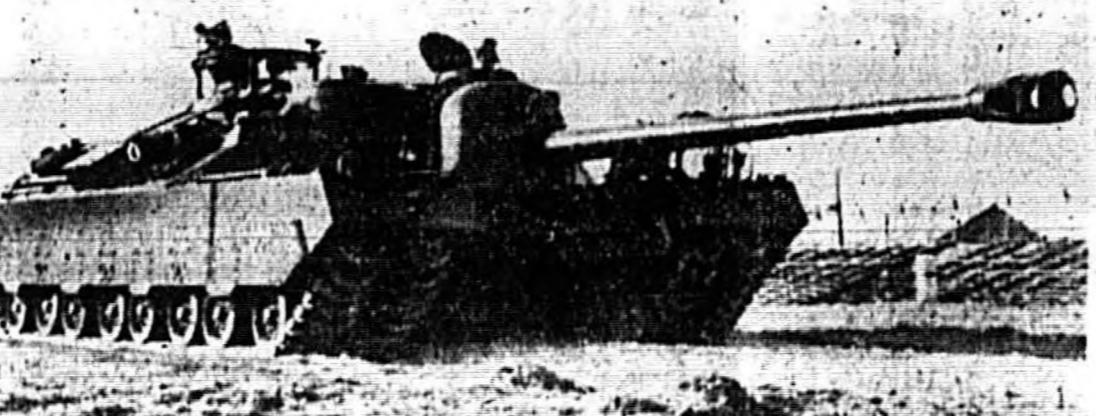
BUILT FOR CLOSE RANGE assault operations, the U. S. Army's newest and heaviest tank is shown for the first time at an exhibition of secret weapons at the Aberdeen Proving Grounds, Aberdeen, Md. The 100-ton land dreadnaught, mounted with a 105-mm. gun, is very heavily armored.