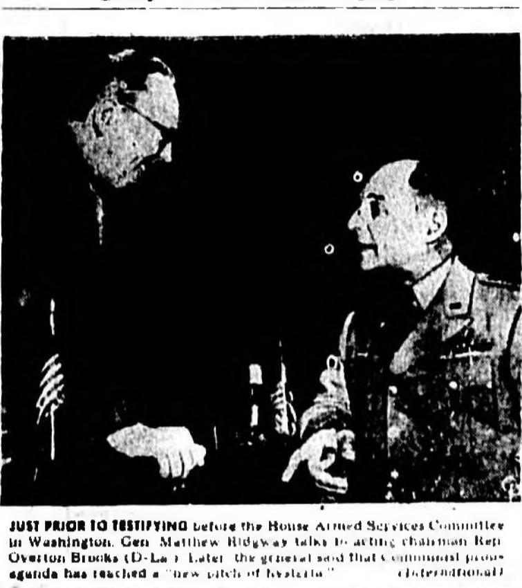
JUST PRIOR TO TESTIFYING before the House Armed Services Committee in Washington, Gen. Matthew Ridgway talks to acting chairman Rep. Overton Brooks (D-La.). Later the general said that Communist propaganda has reached a "new pitch of hysteria."