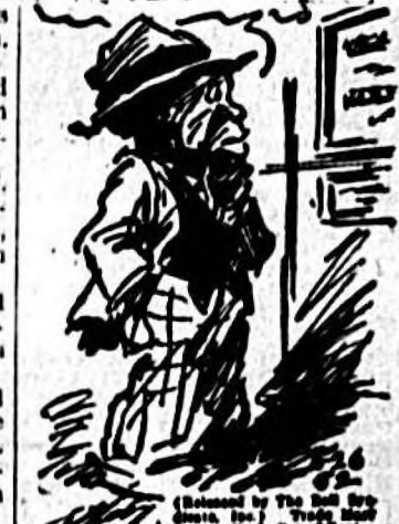
(Illustration by the staff of The Sanford Herald)

I RECKON DAT YOUNG DOCTUM IS AWRIGHT BUT DE OLE DOCTUM HE DONE BIN WHAR DE YOUNG ONE'S GWINE?