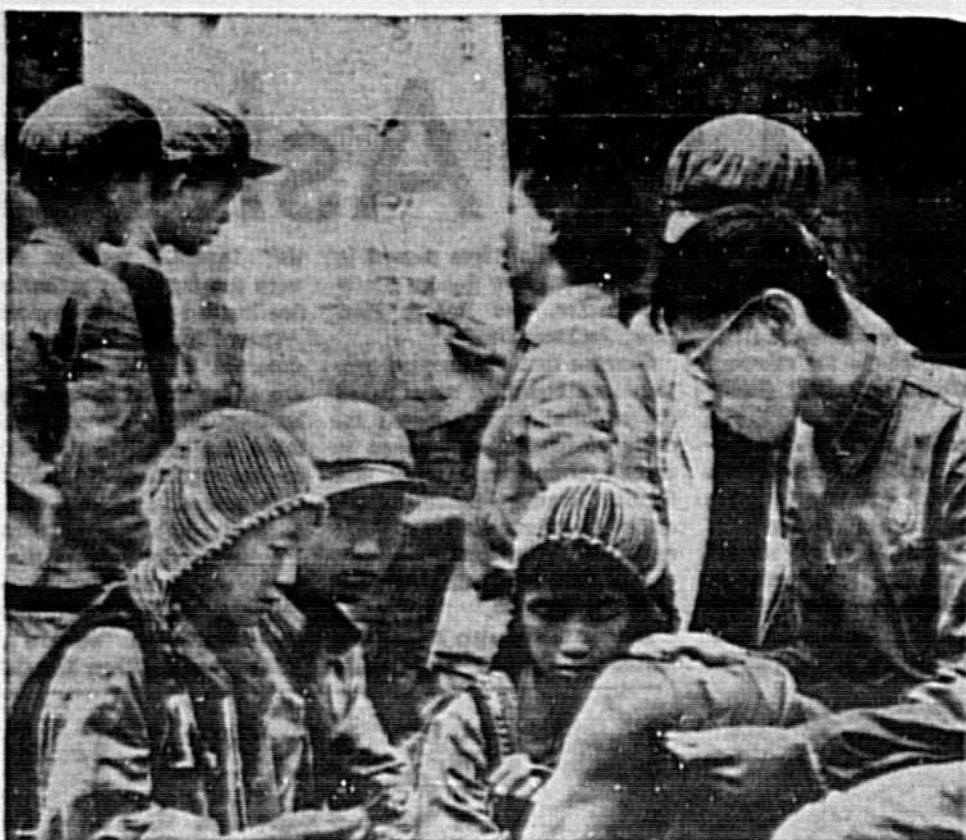
All About Acupuncture, a training session for young Chinese medical workers, above, is pictured in a recent publication. Students at the "June 26" Health School are depicted as practicing the ancient needle technique on themselves. Another area of traditional Chinese medicine—herbal treatments—is also much in vogue. Below, an instructor discusses herb cultivation and use.