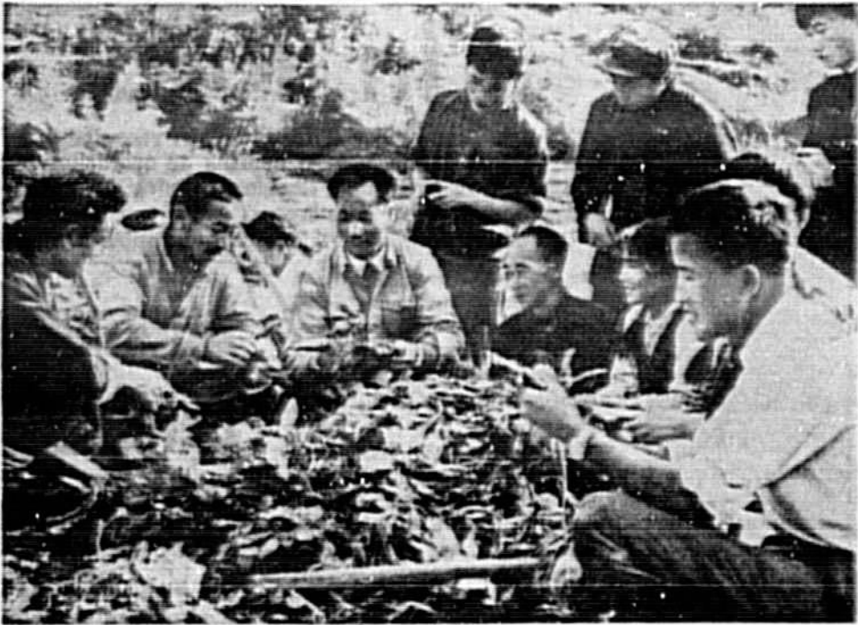
Herb cultivation and use, below, is discussed by an instructor at the "June 26" Health School.