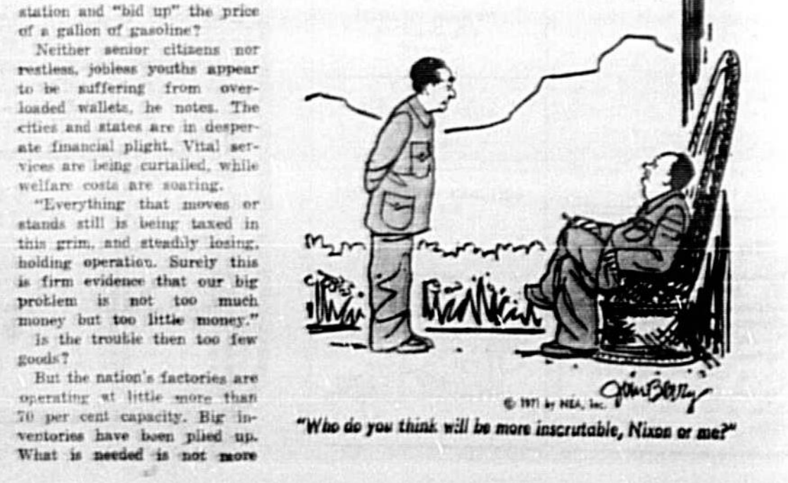
"Who do you think will be more inscrutable, Nixon or me?"