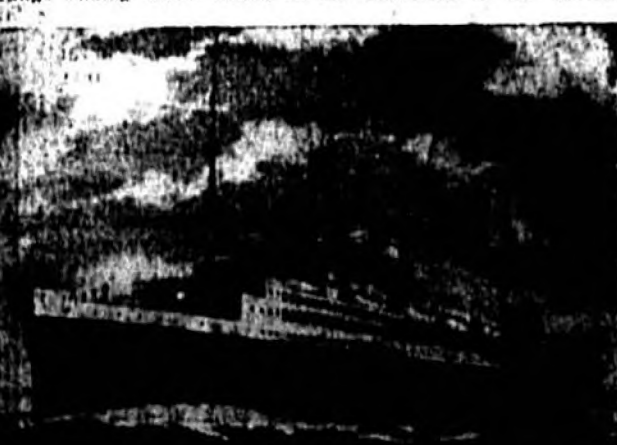
Special of the City-Hallory "return-way" stars which will play a part in making the coming season happy in Florida. Summer vacation history in the city. "Cruiseway" lines will sail at Jacksonville several times during the summer and spring will return through the channel and port.