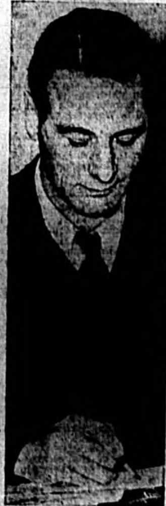
LOU GEHRIG, one-time iron man forced from baseball by form of infantile paralysis, begins new year as parole commissioner of New York City.