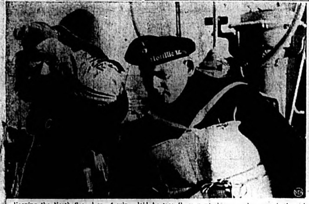
Keeping the North Sea clear of mines laid to trap German war-ships or submarines is the risky job assigned these Nazi seamen...