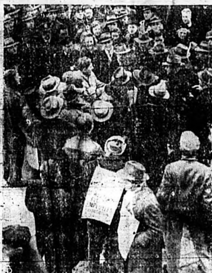
AS THE STRIKE IN 21 Western Electric Plants in New Jersey and New York got under way dozens of melees were staged in front of the Kearny, N. J. plant. Above, a camera catches one of a dozen melees just as it was getting started. Most of the trouble resulted when non-union supervisors tried to crash picket lines and get into the plant.