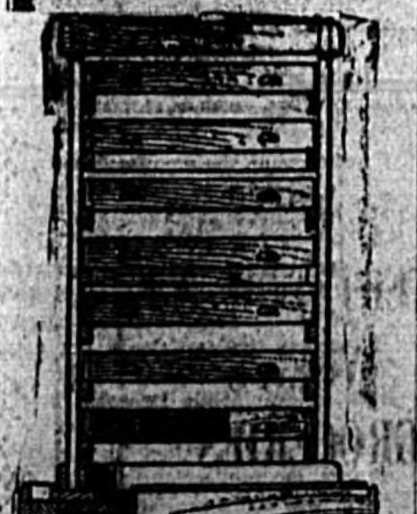
GRAIN SPROUTER (FRONT)