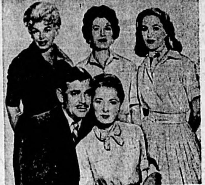
Clark Gable as "The King and Four Queens" is shown here with his "Queens": Eleanor Parker, (next to him), Barbara Nichols, Jean Willes, and Sara Shane. The picture, filmed in CinemaScope and color, opens Sunday at the Ritz Theatre through United Artists release.