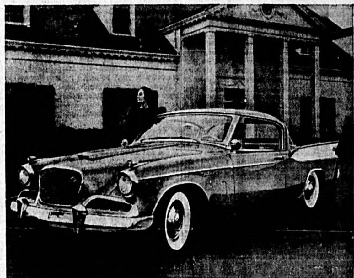
Studebaker's Supercharged Golden Hawk

The sponsor of the new program, North American Van Lines, Inc., is well represented in Florida with a sales office at Miami and Sanford and 26 other local agents in Florida cities.