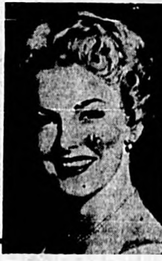
MISS ADELAIDE... Part Vivian Blaine, who scores on Broadway in "Guys and Dolls," repeats her role of nightclub singer, Adelaide, in Samuel Goldwyn's multi-million dollar production of the celebrated Broadway musical, "Guys and Dolls." Frank Sinatra and Jean Simmons also star in the CinemaScope picture.