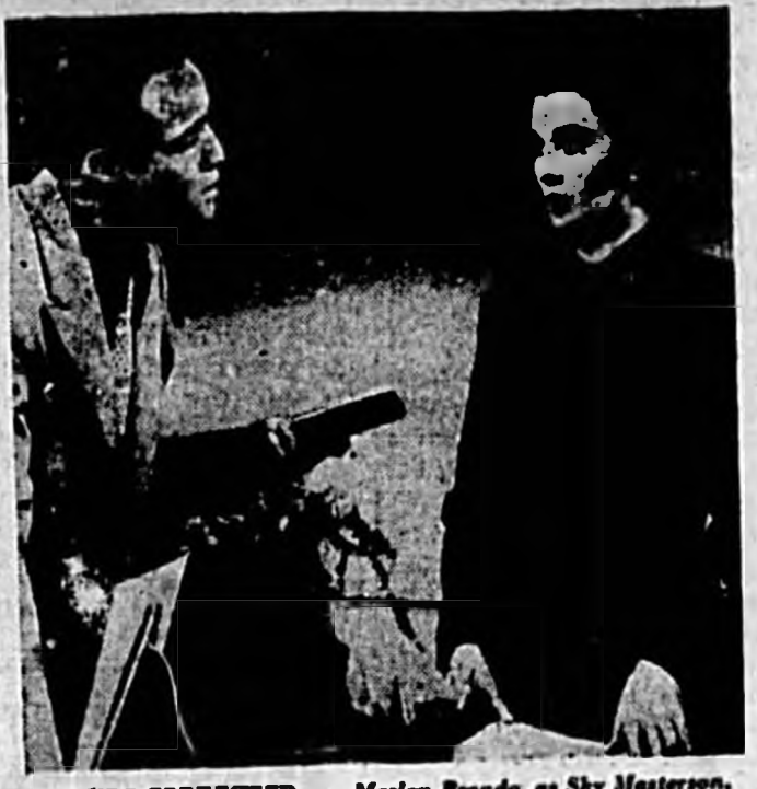
STANDS CORRECTED... Marion Brande, as Sky Masterson, points out to Sara-a-Soul mission worker Sarah Brown (Jean Simmons) that she has misquated the bible in this scene from Samuel Goldwyn's "Guys and Dolls." Frank Sinatra and Vivian Blaine also star in the multi-million dollar production of Broadway's great musical hit, filmed in CinemaScope and color.