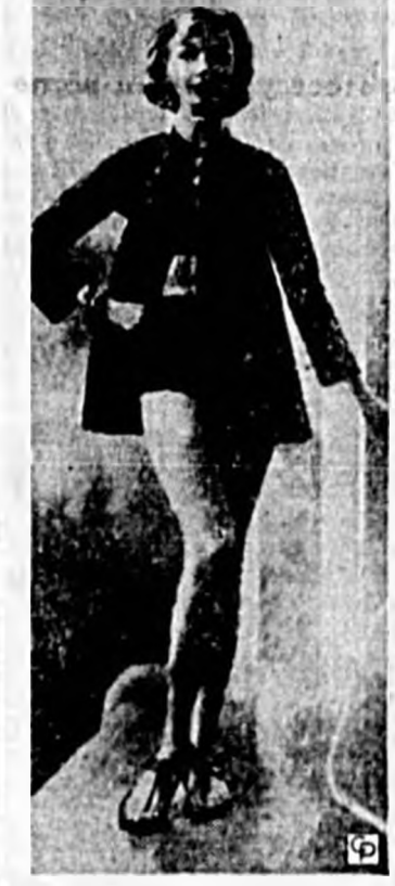
SILK GOES DOWN TO THE SHORE in this play costume by Claire McCordell. Red checks on navy on the pure silk broadcloth. All-round shirring falls from an Empire yoke that is string-tied from a small collar. Beneath are brief shorts and bra, with strings also to tie as you will in typical McCordell style.

Celery led, with a production of about two million crates. This acreage in Seminole County amounted to less than 20 per cent of the total celery acreage in the state, yet the volume produced from this acreage was almost one-fourth of Florida's total production.