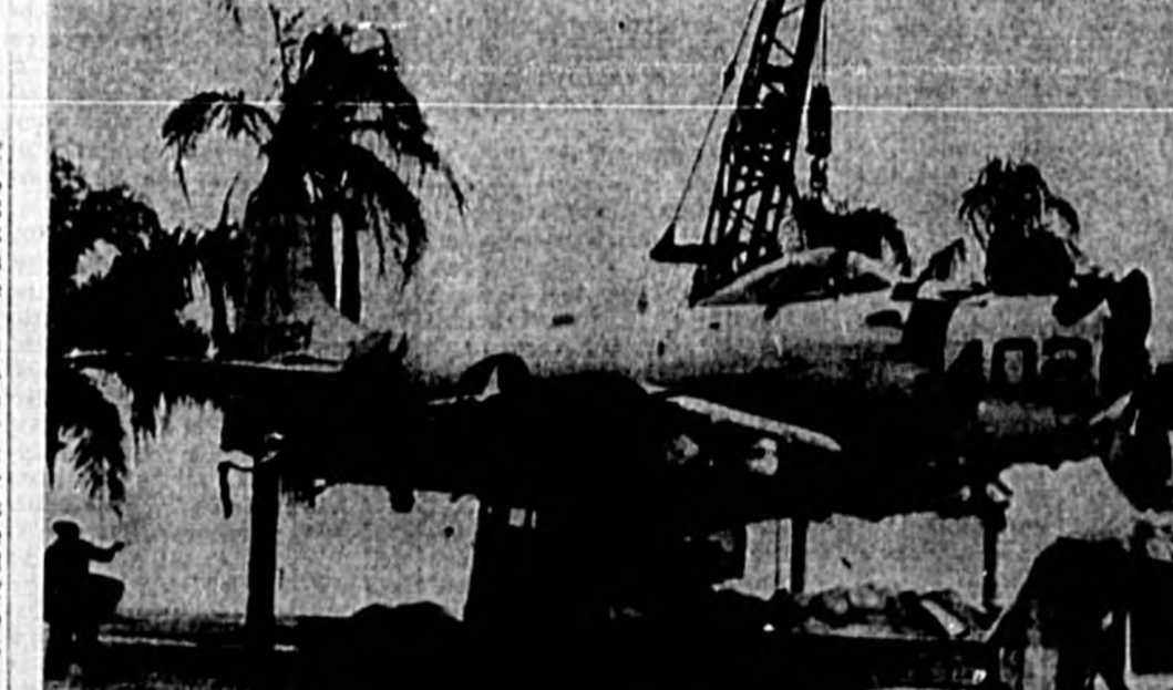
A DOUGLAS SKYRAIDER PLANE is lifted from a Navy lowboy in the loading operation of two planes onto a barge at the Sanford Bandshell. The planes, from the Sanford Naval Air Station, were involved in crash landings.