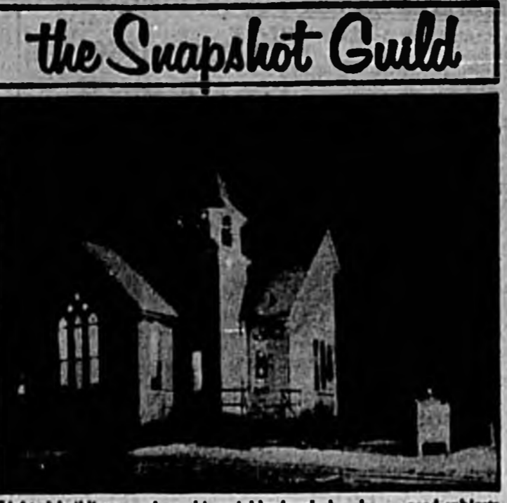
Lighted buildings, such as this neighborhood church, are good subjects for night shooting.

the Snapshot Guild Night-Life for Your Camera Light is a must in picture taking, but that doesn't necessarily mean sunlight. Moonlight, candlelight, street light—all of these will do nicely not only as a source of inspiration for your camera, but as an effective source of light as well. Indoors, either flash or flood can be used to throw light on your subject after the sun has gone down. Essential to any camera on the night shift is a tripod or some other solid support. Without it, you may spend your picture—only to find it is a blur. A camera movement during a time exposure can be fatal to the result. As for the length of exposure to be used for night shots, there's really no hard-and-fast rule to follow. You'll need a little patience and a bit of trial-and-error at first. Since there'll be widely differing light conditions and subjects, your best bet will be to try several exposures—noting the length of time and the lens opening used for each shot. Some picture-takers like to stick to the "rule of three"—one exposure based on checking prevailing con-