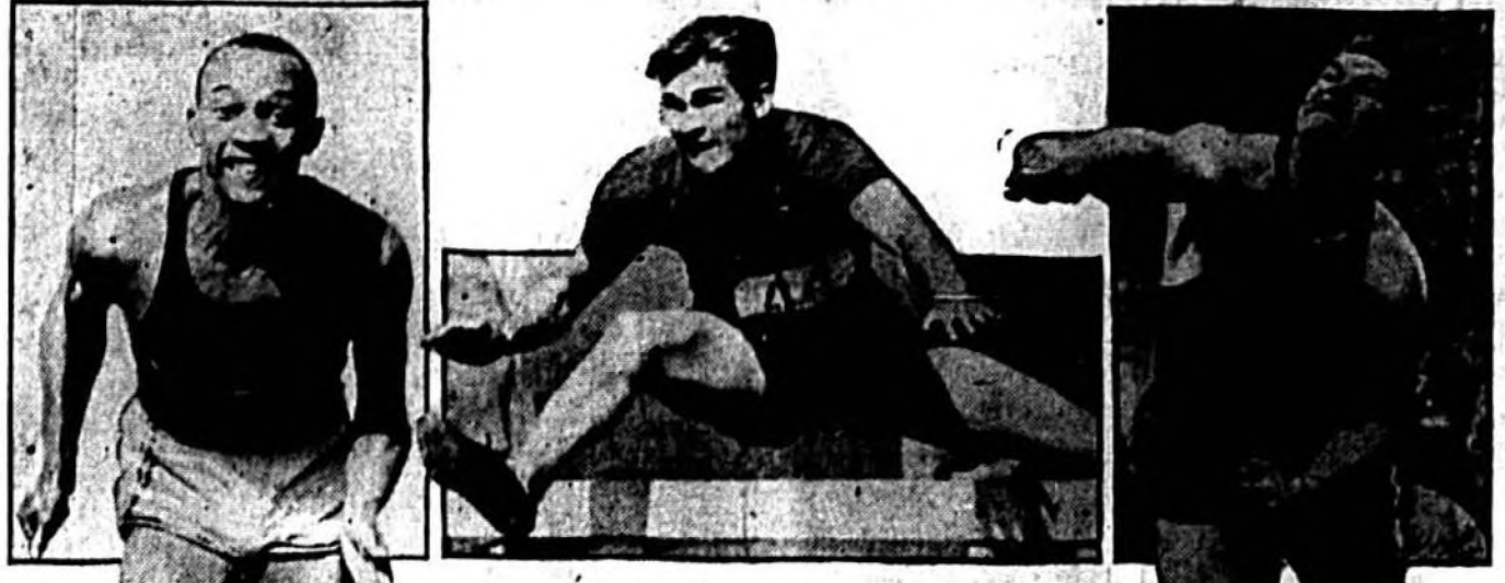
In the upper left is Jesse Owens, Ohio State colored flash, who will represent America in the 200 meter run when the Olympic games get under way at Berlin. Top center is Don Lash, who will represent the United States in the 5,000 meter run. In the center is Don Lash, who will represent the United States in the 5,000 meter run. In the lower left is Don Lash, who will represent the United States in the 5,000 meter run.