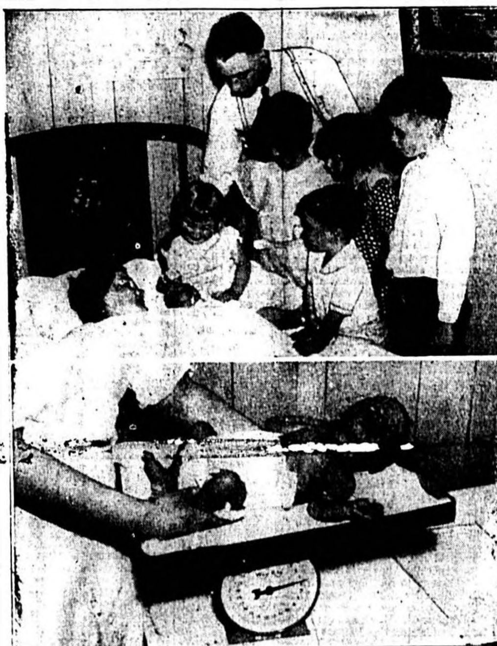
It's a boy this time for the Olivia Dionnes of Callander, Ontario, parents of the famous quintuplets. And here are Papa Dionne and the five older children taking a peep at the youngster in the arms of proud Mama Dionne. The famous quint were not members of the happy party, remaining at their private hospital across the road. Below, is a close-up of the husky baby weighing in.