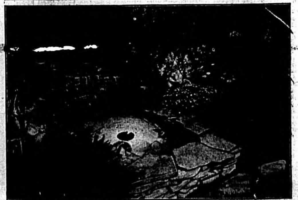
Properly-planned night lighting transforms the garden into a veritable fairyland of color and beauty. The fly ped is made of metal, with the light bulb clamped underneath.