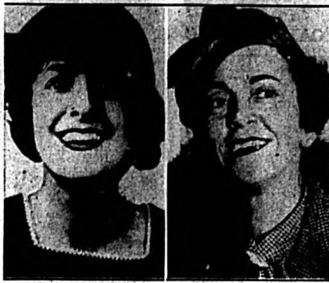
Obedying what she termed "a divine inspiration from God," Elsie Janis, former stage and screen star, announced her decision to give all her "worldly possessions" to charity and devote the rest of her life to aiding the less fortunate. At the left is Elsie as she appeared during World War days when she was known as the "sweetheart of the A.E.F." On the right is a recent photograph of her at 47 years old.