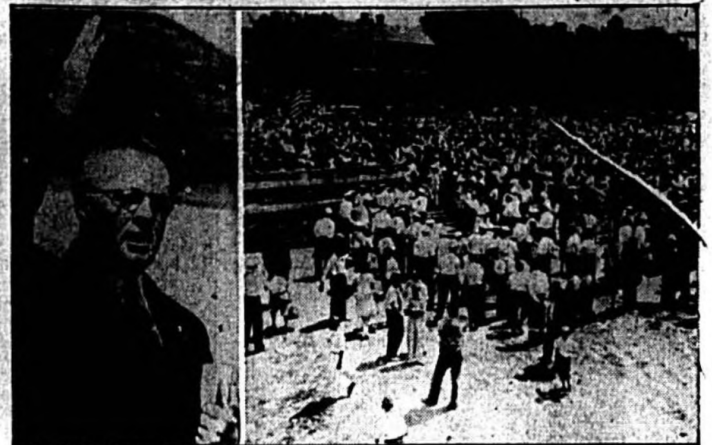
At the inauguration of the campaign led by John L. Lewis to organize 500,000 steel workers into one big union in defiance of employers' bitter opposition, Lieut. Gov. Thomas Kennedy of Pennsylvania told a mass meeting of workmen at Homestead, Pa., that state relief would be provided for any forced from their jobs. Kennedy is shown (left) speaking and at the right is a section of the crowd that heard him.