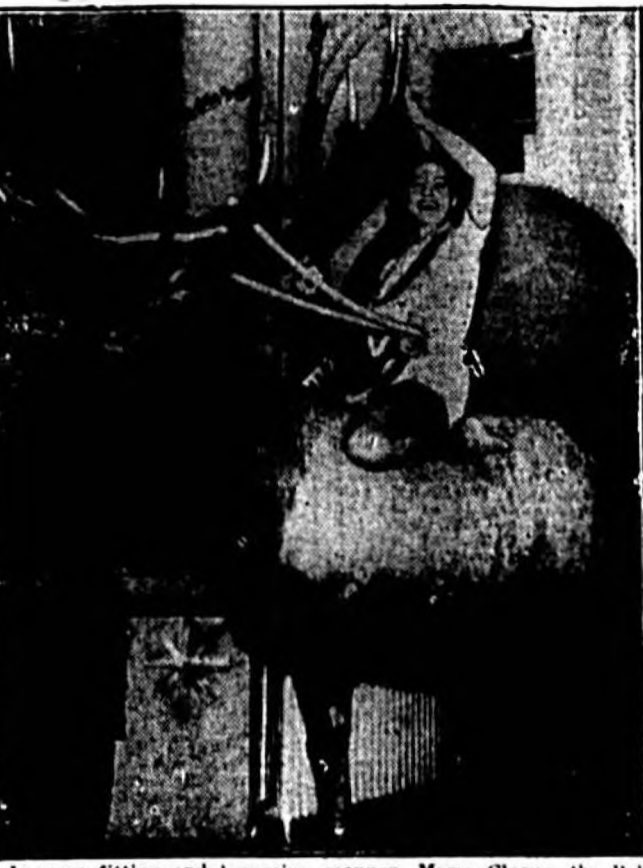
In very fitting and becoming manner, Mamie Clarke, the Polynesian beauty, makes friends with the emblematic beast at the Honolulu lodge.