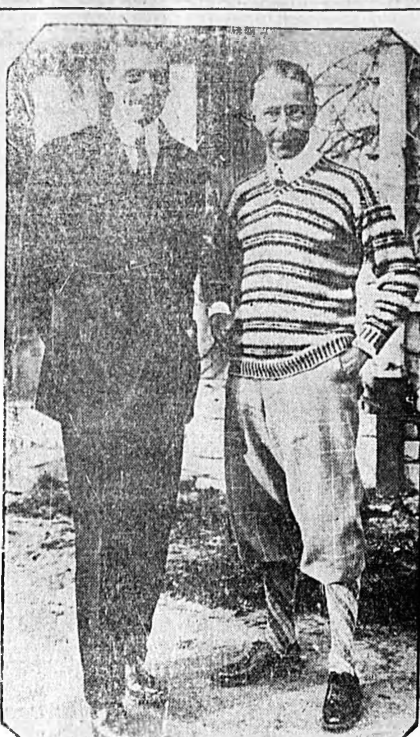
Christian X, king of Denmark, visiting Berlin, dropped in to swap a lie with little Willie Hohenzollern, whose alias was once "the crown prince." Here they are—Willie, needless to say, at the right.

There are 2,130,000 licensed radio listeners in England, 1,337,122 in Germany; 238,000 in Sweden; 114,492 in Denmark; 53,050 in Hungary and 51,769 in Switzerland.