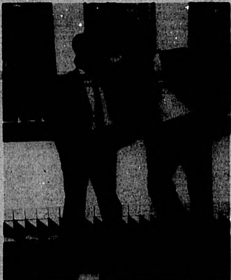
The Blues Brothers