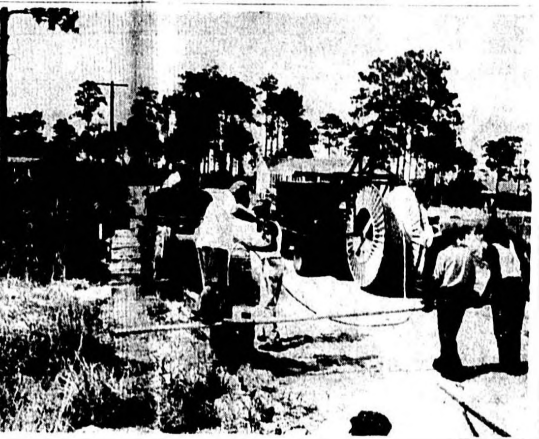
Workers of the Southern Bell Telephone and Telegraph Co. are shown laying telephone cable from Enterprise to the new community of DeBary and Plantation Estates. The cable will be laid on the bottom of Lake Monroe to complete the phone exchange. The appliance attached to the tractor at left cuts a trench into which the cable from the big spool at right is fed through a pipe on the approach to DeBary.