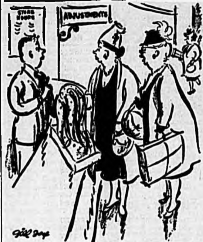
"Oh, I'm in no hurry, sir. Let her finish what her sister-in-law said when the dress pulled out at the seams!"