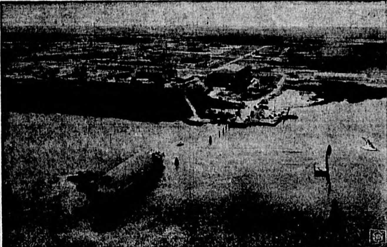
SPACE AGE "COVERED WAGON" — Covering on this barge approaching Cape Kennedy, Fla., recalls the canvas hoods of the pioneers' Conestoga wagons. In this vehicle for pioneers of the space age, however, is the S-1 first-stage booster for the Saturn, mightiest of Uncle Sam's rockets.