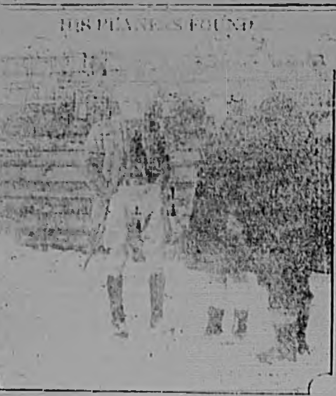
THIS PLANE IS FOUND

The attorney general declared that candidates in the primary elections must not be "hanerants" or "split ticket" voters.