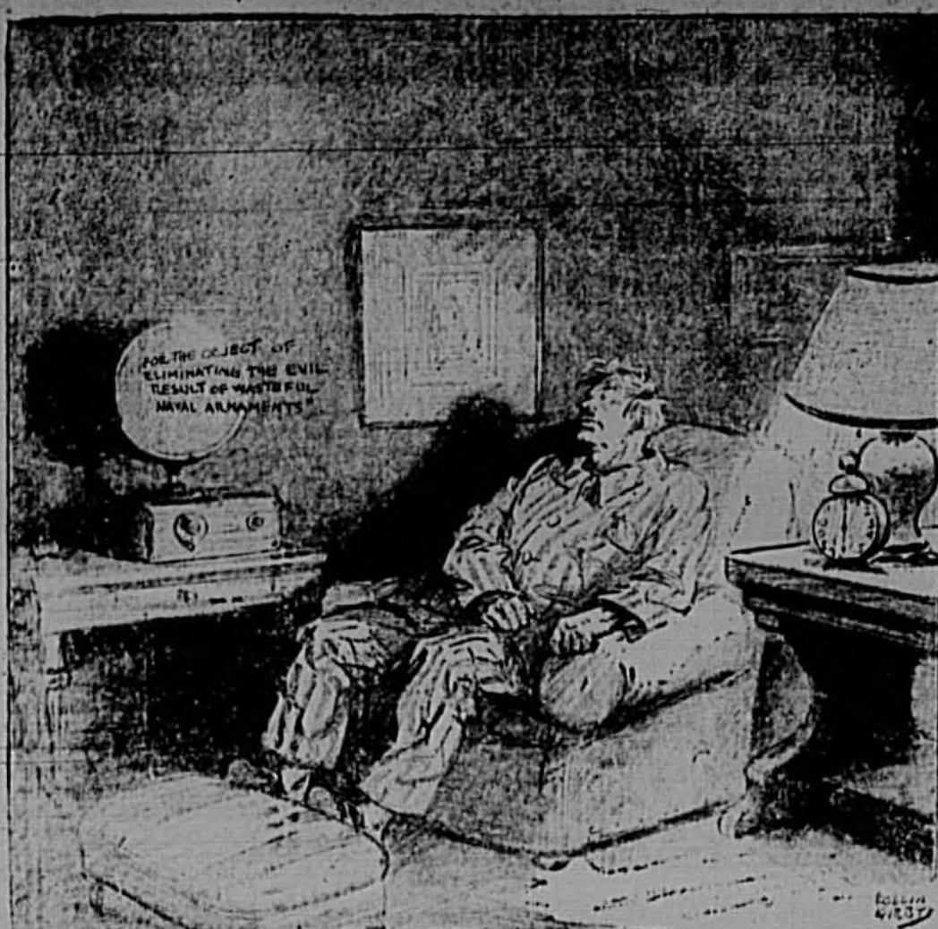
FLORIDA VITALLY INTERESTED TAMPA TIMES

Since a protective tariff is plainly the American policy, the tariff should be so free to give equal and necessary protection for all up and down the line, and never levied so as to provide more than liberal protection for some things, and denying the necessities of others. Florida has become thoroughly impressed with this since she has seen her products come into competition with those of foreign countries which would produce them cheaper—hence the Florida demand for increased tariffs on fruits and vegetables.