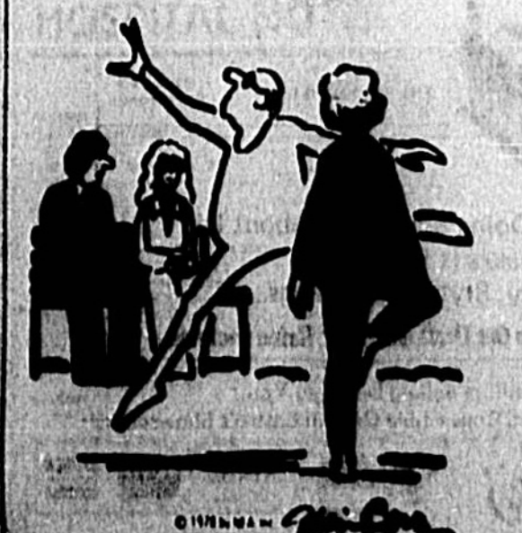
Have you noticed that ballet has become very very popular of late?