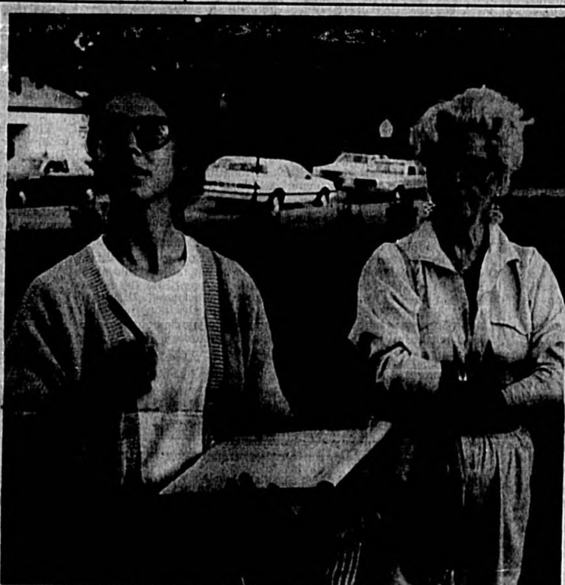
Preparing for tonight's 'park' meeting