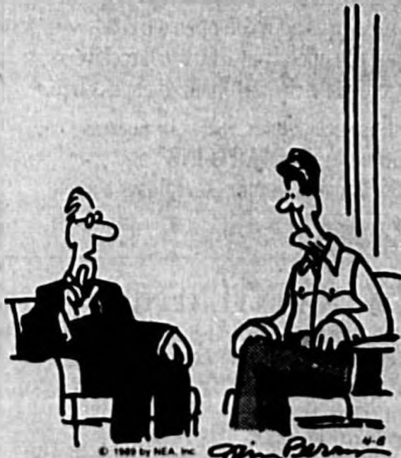
"East is east, west is west — and North is North."