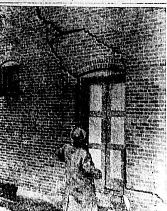
This picture, showing the crack in the brick wall of a building in a town which is sinking, was taken by a member of the team of geologists who are studying the town. It is one of the many towns which are sinking in the area of the Sanford mine.