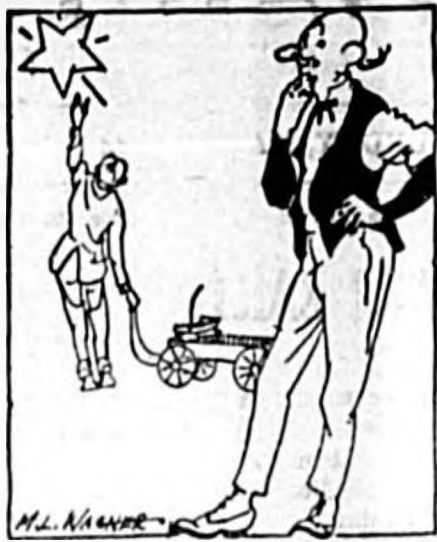
The feller who hitch his wagon to a star haint bothered with any tall gettin' mixed up with th' reias.

and federal aid. They have secured the majority of the state institutions, including the state capital, and propose to hold them as long as possible, and all indications seem to be that it will be a long time before their grip can be loosened.