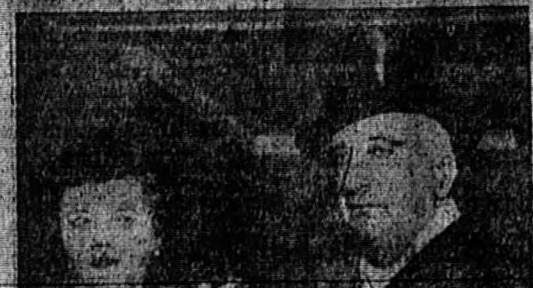
A TEACHER at the Williams High School...