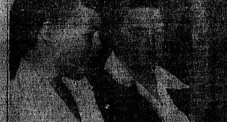
JUSTICE OF THE U.S. Supreme Court...