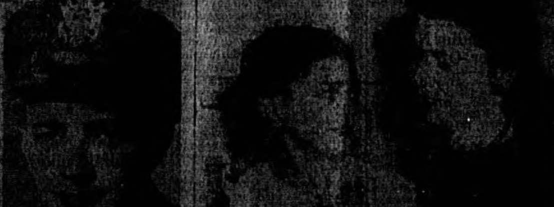
THE STRONG ARM OF THE LAW is needed...