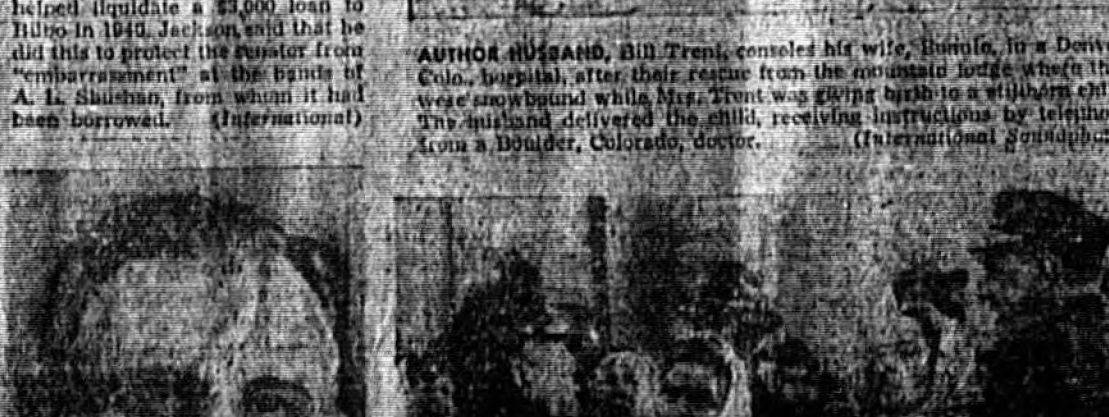
MOURNING AND FOOT POLICE GUARD THE GATES...