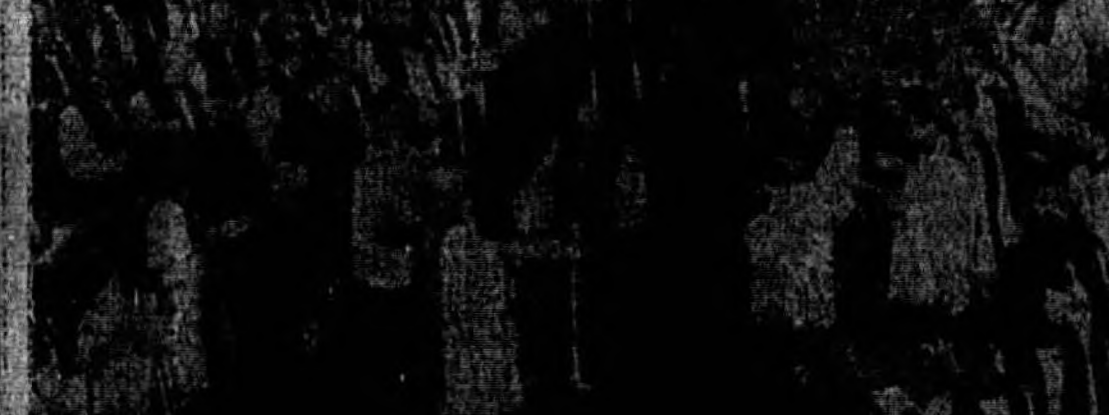
THE ECONOMIC ADVISORY COMMISSION...