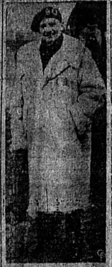
CHIEF of the British Imperial Staff, Field Marshal Lord Montgomery wears a heavy sheepskin coat for his arrival at an airport in Moscow, Montgomery, arriving at a guest of the Soviet General Staff, made it clear that his visit held no political significance. The Field Marshal paid his tribute to the Russian lighting man.