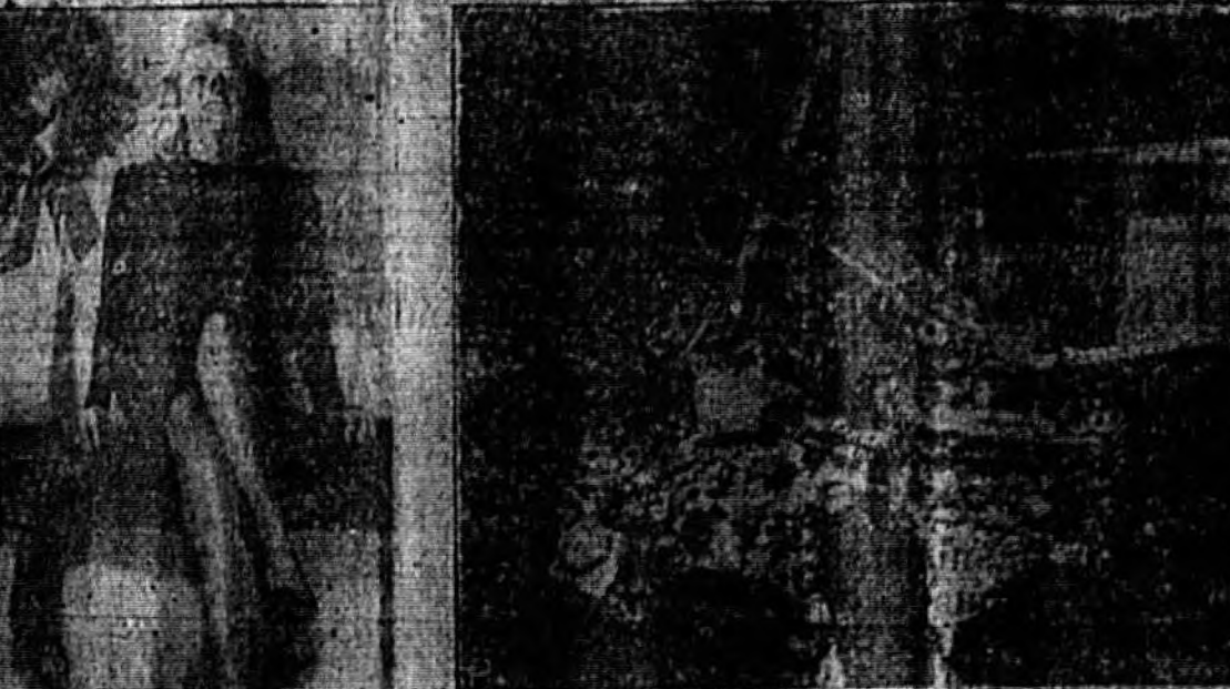
WORKING UNDER FLOODLIGHTS, a steam shovel...