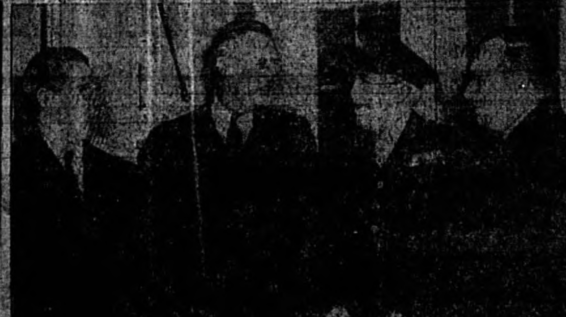
THE ECONOMIC ADVISORY COMMISSION...