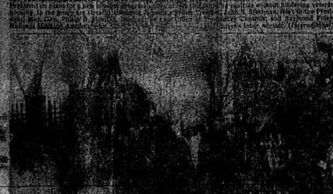
THE ECONOMIC ADVISORY COMMISSION...