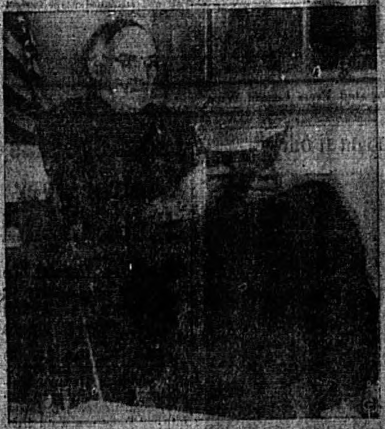
A GROUP of history designers have selected...