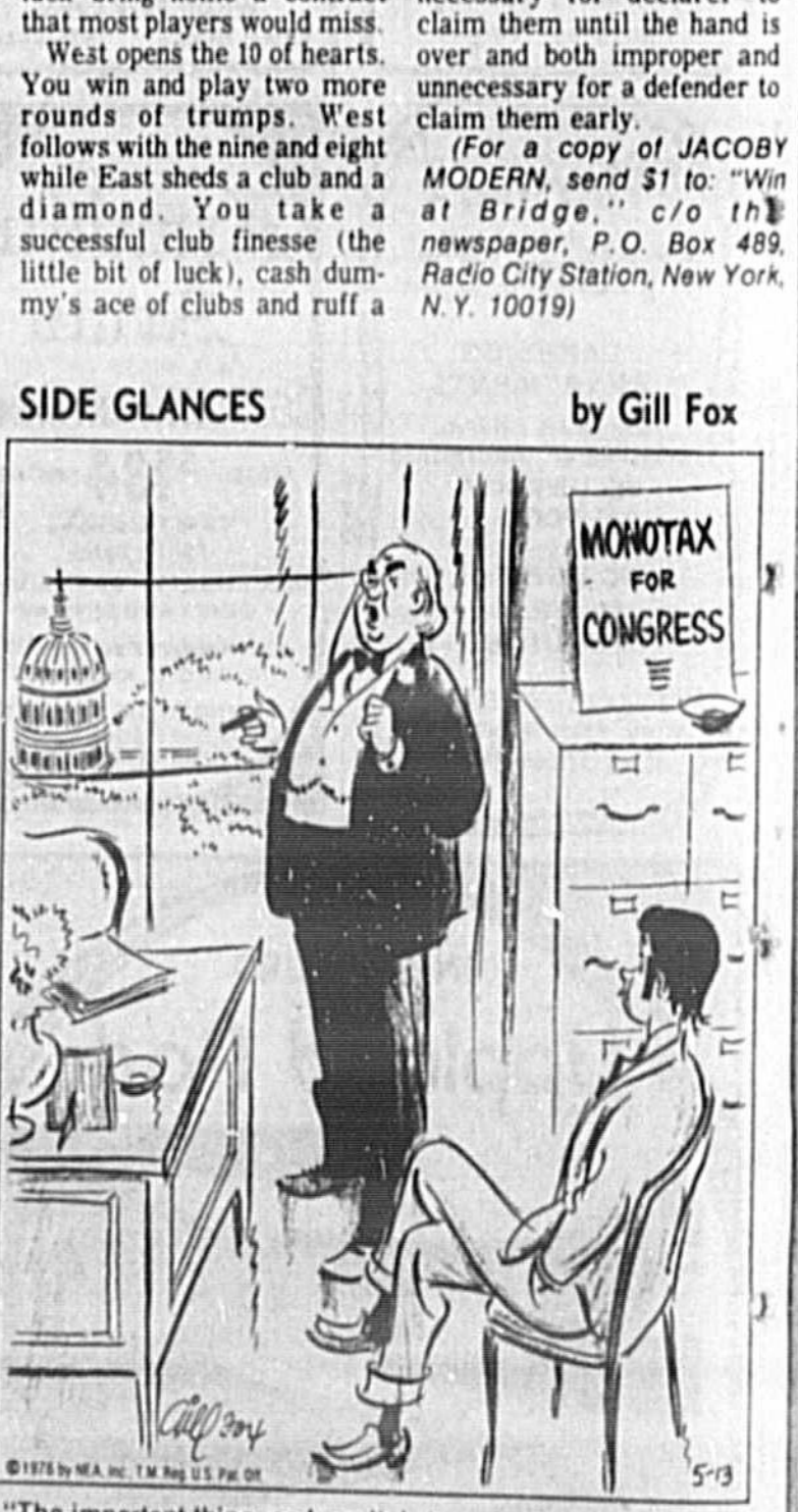
SIDE GLANCES by Gill Fox