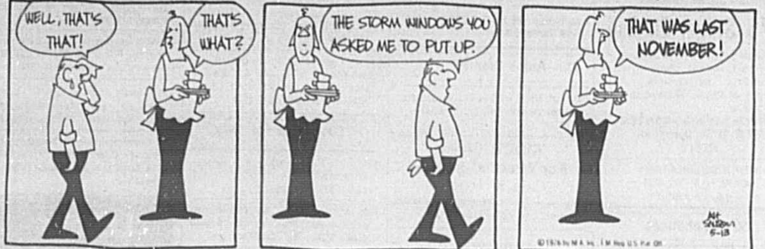
THE BORN LOSER by Art Samsom