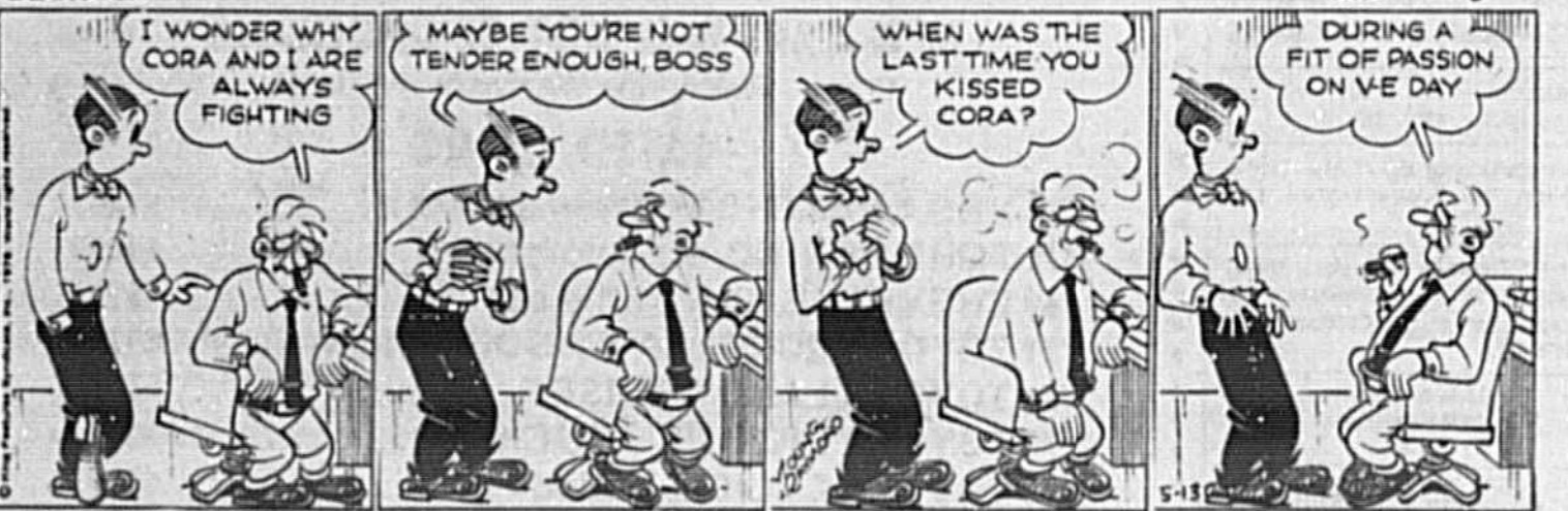
BLONDIE by Chic Young