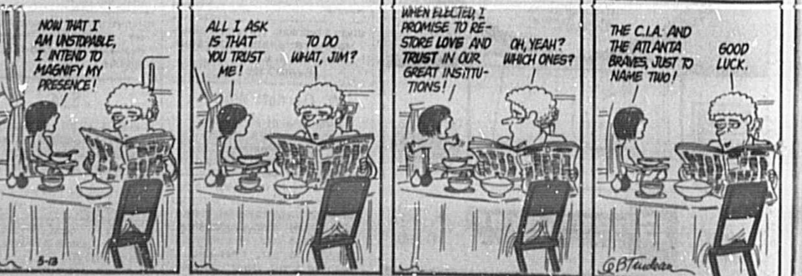
DOONESBURY by Garry Trudeau