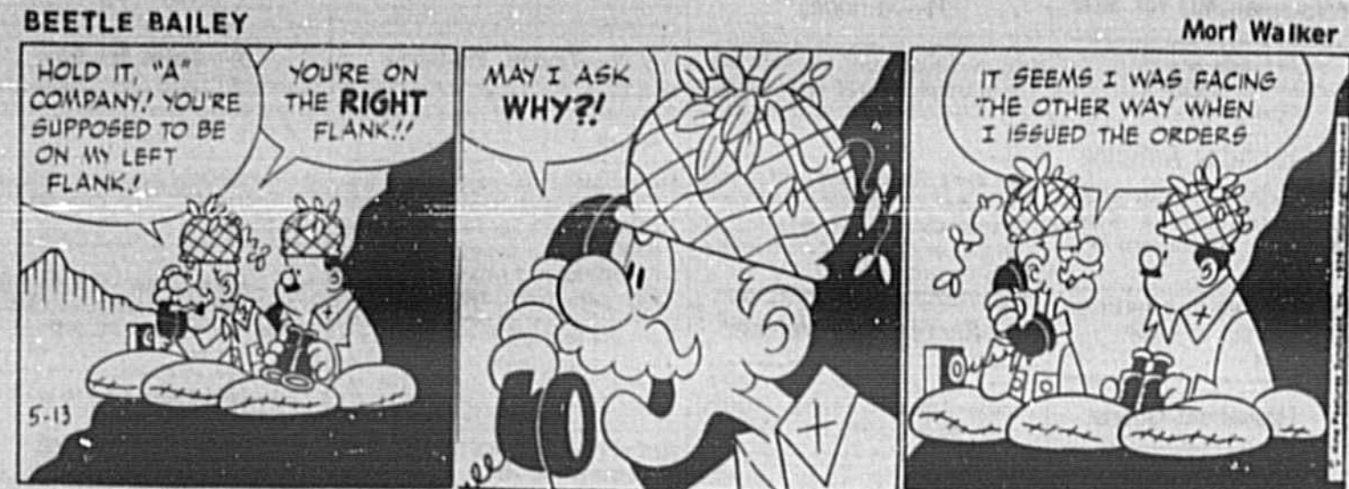
BEETLE BAILEY by Mort Walker