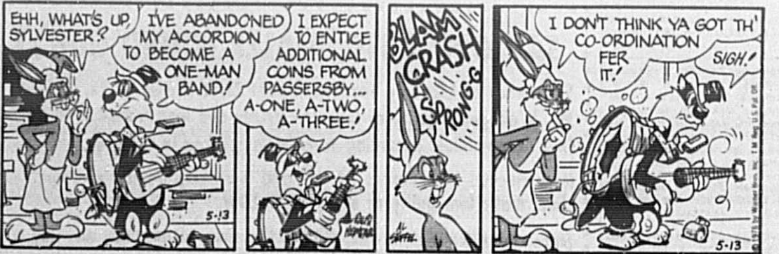
BUGS BUNNY by Stoffel & Heindahl