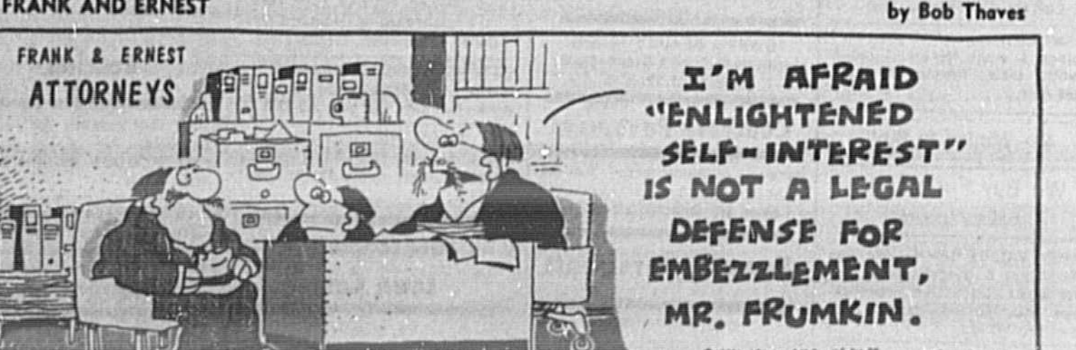
FRANK AND ERNEST by Bob Thaves