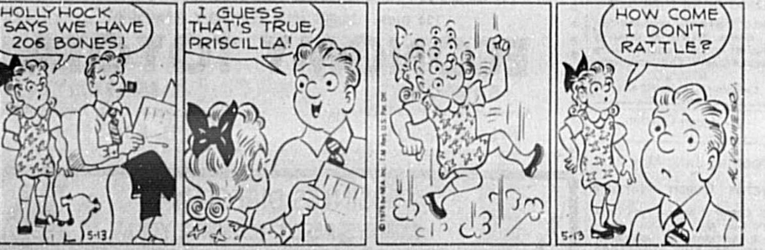
PRISCILLA'S POP by Al Vermeer