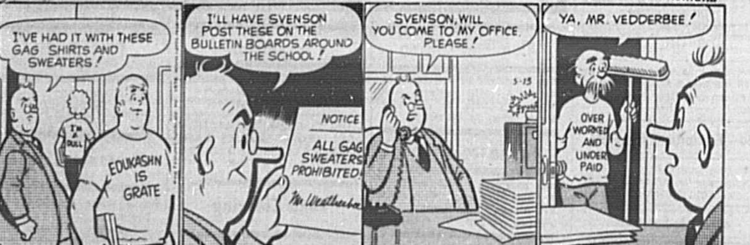
ARCHIE by Bob Montana