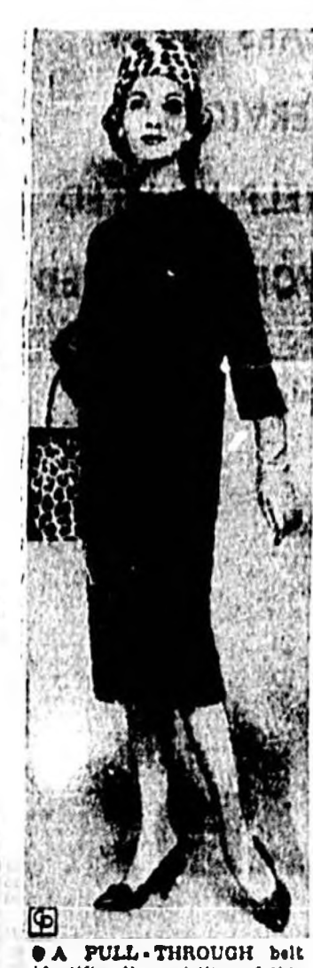
identifies the waistline of this double - breasted navy and black sheer wool daytime dress from Harvey Berin's fall collection designed by Keren Stark. Both neckline and bett are lightly etched with bleck

The Adult Choir of the First ple of the church. Baptist Church will meet to rehearse at 8 p. m.