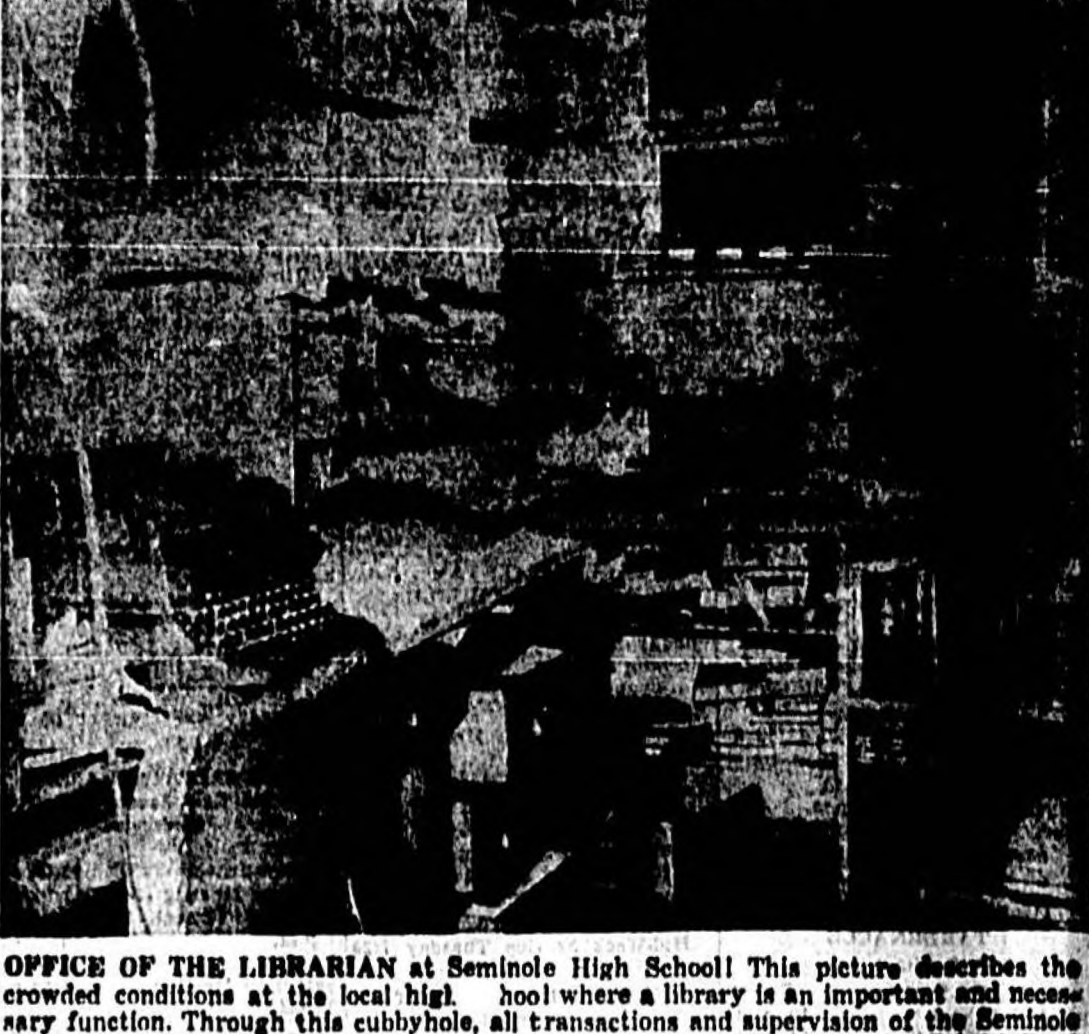
crowded conditions at the local high hool where a library is an important and necess sary function. Through this cubbyhole, all transactions and supervision of the Seminole High School Library must go. This is one of the many reasons why, the School Bond Issue is one of the most important issues to be voted on in the Sept. 9 special election.

This time, however, it will be a had little to say but "I am sure But this time, he said "there little happier occasion. Until that