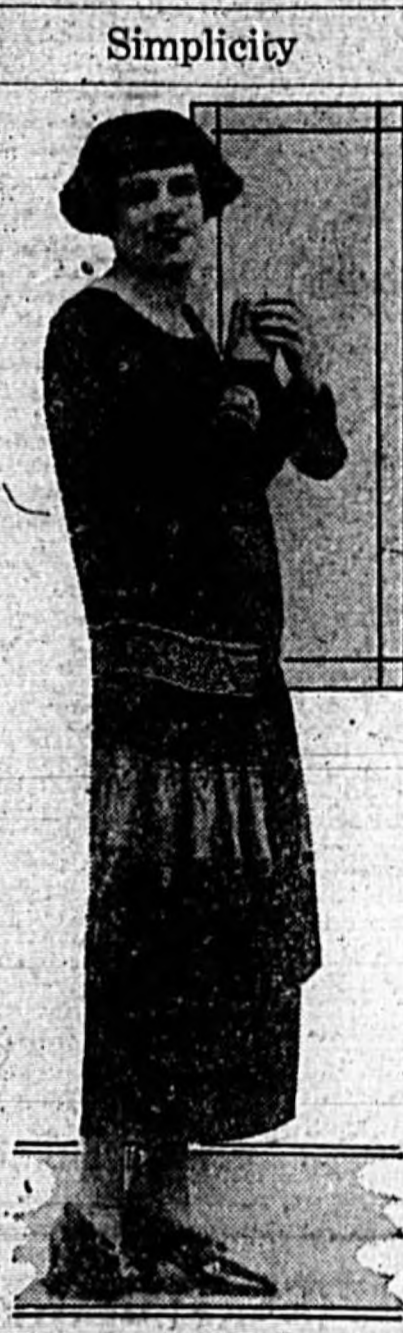
A pleasing combination of simplicity and subtlety is achieved in this frock of black satin-backed crepe. The long waist is outlined by an embroidered girdle and more elaborate ornamentation is seen in the band of gray embroidered satin introduced on the tunic.